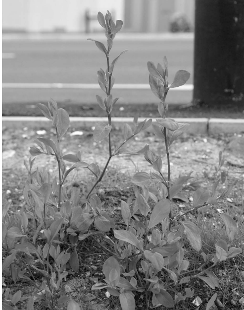
Fig. 1 Northern Knotgrass ( Polygonum boreale ) on a roadside verge in Taunton

(Danish Scurvy-grass), Puccinellia distans subsp. distans (Reflexed Saltmarsh-grass) and Spergularia marina (Lesser Sea-spurrey) are now well established on road verges in many parts of Somerset. The status of coastal species once they venture inland has been a subject of much debate. Scott (2003) is certain that coastal plants initially arrive on roadsides by carriage on vehicles, later spreading in the slipstreams of traffic flow, and therefore thinks it correct to treat these inland records as alien (or introduced), as was done by Preston et al. (2002) who mapped such species as 'native' on the coast but 'alien' along inland road verges. Yet, as pointed out by Leach (2003), other (non-coastal) species occurring on road verges are often unquestioningly assumed to be 'native', even though their mode of arrival is usually unknown and may have been as much the result of introduction by man as that of the (more obviously 'out of place') coastal species.