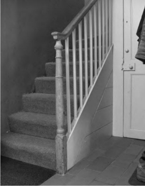
Fig. 21 Stogursey, High Street, No. 2, stairs