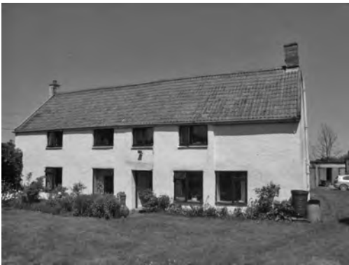
Fig. 35 Stogursey, Shurton, Lower House Farm

The house (Fig. 35) was the subject of an earlier survey by R. Gilson in 1983. It has a main range of two rooms, one each side of a passage. The room to the west of the passage has been extended and there are additions at the rear. The roof structure is indicative of a date in the early 17th century and the position of the three trusses suggests that at least one more bay existed to the west. This would suggest a three-room and cross-passage plan. However, the common arrangement of the hall heated by a fireplace backing onto the cross-passage is not borne out in the roof structure, as there is no interruption to accommodate the stack. A possibility suggested by Gilson is that a fireplace was sited on the north wall. Also he recorded that the south wall immediately east of the passage was thicker and thus may have been part of an even earlier structure. In the 18th century an outshut was added at the rear and in the late 18th or early 19th century the west gable was removed and the house extended. On the 1886 and 1904 OS maps the property is marked as a beer house and Gilson reported that it had been known as the First and Last Inn.