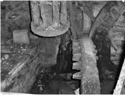
Fig. 40 Stogursey, Wick Mill, gearing