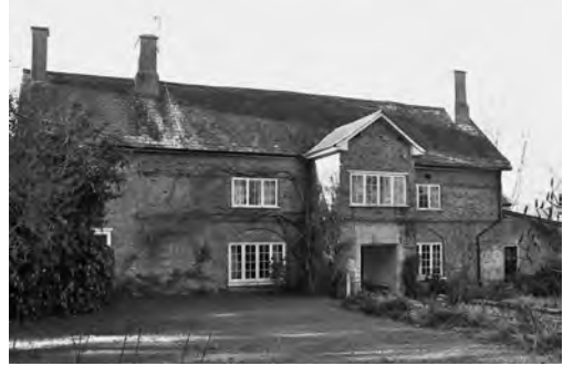
Fig. 10 Stoke St Mary, Haydon Farm

The farmhouse (Fig. 10) is part of a large farmstead and comprises a two-unit plan with central cross-passage with a two-storey addition on the south gable end and lean-to additions at the rear. The form of construction and the details indicate a date in the late 17th century. Built of brick in Flemish bond, there is no evidence to suggest that it is the cladding of an earlier building, as proposed in the Listing description. The original plan would have been kitchen, cross-passage and parlour with two gable stacks and first-floor rooms and attics. The parlour ceiling was formerly divided into four equal parts, three of which have decorative plasterwork – an eight-pointed star-shaped pattern with fleur-de-lis