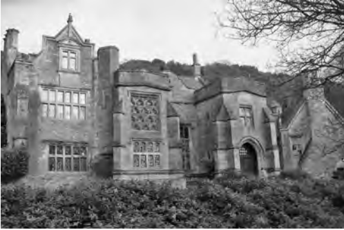
Fig. 1 Clevedon Court, south front

is conjectural, but it appears that the western solar block and the eastern kitchen and tower are survivals from that period. In particular the very thick walls, narrow windows and proportions of the tower strongly suggest a guard tower (Fig. 2). The kitchen is usually referred to as the old great hall, but this is more likely to have been a detached kitchen, with the original hall standing further to the west. The dating of this part has been confirmed by