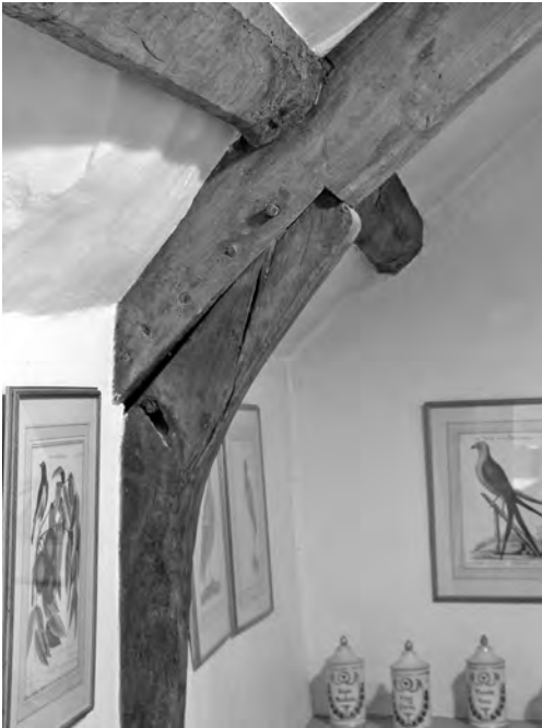
Fig. 7 High Ham, Hillbourne, jointed cruck