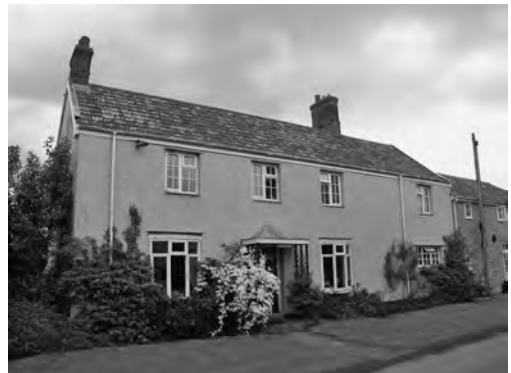
Fig. 29 Stogursey, Knighton, Glebe House

The house (Fig. 29) has three rooms in line with an addition to one side and shallow additions at the rear. The roof structure and other details indicate an initial date of construction at the end of the 18th or beginning of the 19th century. Then it comprised two rooms with an entrance hall between. The original stair probably rose from the hall and there may have been a lean-to scullery at the rear. Prior to 1886 the house was extended by the addition of another room. The stairs may have been relocated to their present position at the same time. Access directly from the added room to the adjoining 'barn' appears to be of long-standing. There were additions at the rear in the 20th century and the barn has been incorporated into the living area.