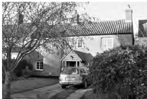
Fig. 34 Stogursey, Shurton, Bishop's Cottage

The house (Fig. 34) has a two-unit plan with a central-entry cross-passage and lean-to additions at the rear. Structural and decorative details suggest an early/mid 16th-century date for the original build. The house was then of one-and-half-storey and comprised a hall, cross-passage and kitchen with a large fireplace incorporating an oven and curing chamber. There may have been a small outshut at the rear of the kitchen. This plan form is relatively rare in Somerset, although it is similar to the plans of Myrtle Farm and Fisher's Cottage, both in Shurton (see SANH 151 (2008), 196 and SANH 152 (2009), 239). Perhaps in the early 19th century the curing chamber became redundant and a second staircase was installed in its place and at about the same time the walls and roof were raised to create two full storeys. Later in the 19th century the rear outshut was removed (it appears on the 1887 OS map) and soon after new stairs were inserted and a rear lean-to built. Interesting survivals are two salt or spice cupboards, one alongside the kitchen fireplace and the other next to the fireplace on the first floor above the hall.