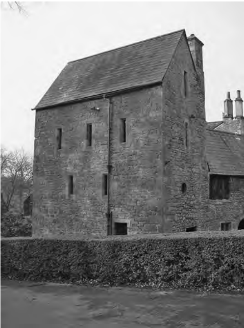
Fig. 2 Clevedon Court, tower

is conjectural, but it appears that the western solar block and the eastern kitchen and tower are survivals from that period. In particular the very thick walls, narrow windows and proportions of the tower strongly suggest a guard tower (Fig. 2). The kitchen is usually referred to as the old great hall, but this is more likely to have been a detached kitchen, with the original hall standing further to the west. The dating of this part has been confirmed by