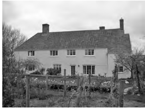
Fig. 31 Stogursey, Peadon Farm

The house (Fig. 31) is part of a working farmstead with an adjoining cottage, formerly a granary. The main house has a two-unit plan with central entry/cross-passage and a later wing at the rear. The wall thicknesses of the main range (perhaps cob) and the structural details of the roof trusses suggest a late 16th-century date. Probably in the early 17th century, the house was remodelled which included the insertion of fireplaces and cob stacks (visible in the roof space) and the partitions either side of the cross-passage. The hall fireplace bressumer has a number of holes cut through which suggests that it may have held a spit-jack. The house then comprised hall, cross-passage, kitchen and turret stairs. A small room off the kitchen may have been a corn-drying kiln and for malting barley. The structure shows that it had a flue rising through the first floor and joining the main stack at high level. The 1841 Tithe Map shows the former granary, but the north wing did not appear until the 1886 OS map. It was later described as a kitchen with pantry off, back kitchen,