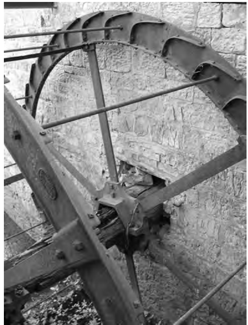
Fig. 14 Stogursey, Castle Street, Town Mill, wheel

In the loft, most of the sack hoist survives and the remains of the timber launder have been stacked at the far end of the loft. The surviving evidence suggests that the present mill building dates from the mid 18th century and that the extension was added in the 19th century. Of the mill machinery, the vertical shaft and some of the gear wheels are probably 18th century, whilst the wheel, cast by