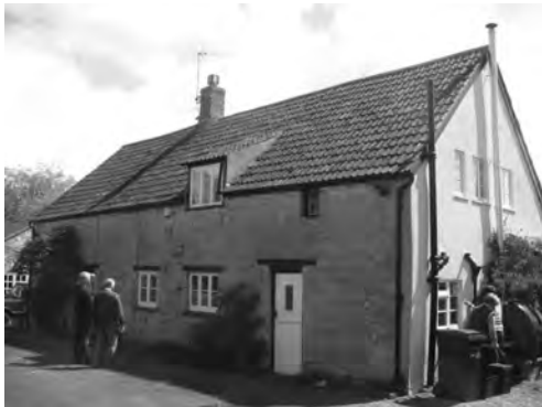
Fig. 4 Fivehead, Spring Grove

The house is of one-and-half storey with three rooms in line (Fig. 4). A building date in the late 15th century is suggested, based on the beams of the inner room, roof construction (including one jointed-cruck truss) and the smoke blackening of the timbers. The house then comprised an open hall and an inner room with a solar chamber over. Traditionally the entrance would have been at the low end of the hall and there may have been a service room beyond. It is conjectured that in the early 16th century there may have been a smoke hood in the service room, based on the evidence of soot deposits. Around 1600 an upper floor was inserted over the hall, together with a fireplace and stack. The inner room then became a parlour. It is further conjectured that the service room was upgraded to a kitchen with a fireplace, oven and curing chamber in the east gable. Also a cross-passage was created. For some reason, c. 1700 the kitchen was destroyed (perhaps as a result of a fire) and to compensate an oven was built next to the hall fireplace. Around 1800 the east end was rebuilt with a loft above. The 1886 OS map shows that a building had been added at the east end of the south elevation and, as in 1841 the property was a small holding of about 24 acres with three orchards, it seems likely that the 'new' building was a cider house and cellar.