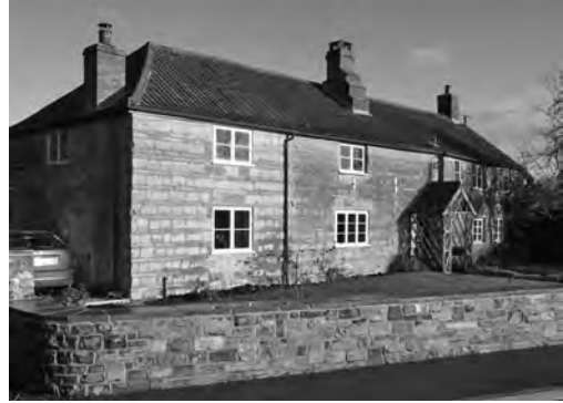
Fig. 5 High Ham, Hillbourne

The house (Fig. 5) comprises three rooms in line with a cross-passage and the misalignment of the end room together with variations in wall thickness indicate at least two periods of building. The first phase includes the part to the east of the cross-passage and, based on the details of the beams (Fig.