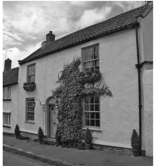
Fig. 17 Stogursey, Castle Street, No. 8

The house (Fig. 17) has two rooms with a central passage and a lean-to extension to one side at the rear. A former workshop was situated on the other side of a yard. The evidence of structural and internal details (Fig. 18) suggests that the house was built in the early 19th century and then comprised two rooms with an outshut, used as a scullery. An extension to the rear covering part of the yard was added probably in the second half of the 19th century and the lean-to raised to provide an additional first-floor room. The stairs were also relocated at this time. In recent years the workshop has been incorporated into the living accommodation.