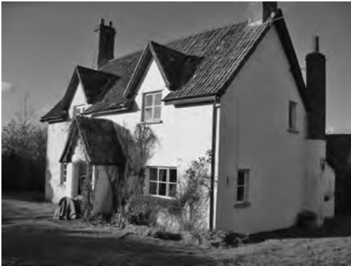
Fig. 19 Stogursey, Colepool, No. 41, Webber's Cottage

The house (Fig. 19) has a two-unit plan with a central entry into a staircase hall with a lean-to at the rear. There is a detached single-storey utility building at the rear. Originally built c. 1800, the house then comprised parlour and living room/kitchen with two service rooms in the lean-to used as a scullery and perhaps a dairy.