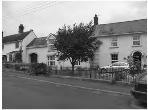
Fig. 25 Stogursey, High Street, No. 46, Quantock House

The house has a principal block of rectangular plan fronting the street (Fig. 25), but has a complex history with additions to the rear and sides. An unusually thick wall in one room may be the relic of a medieval structure, but no other evidence survives. The roof structure, wall thicknesses and beams indicate that the main house was built at the end of the 16th or the beginning of the 17th century. It would then have been of one-and-half storey with, probably, a single-storey lean-to at the rear. Alterations, perhaps in the 18th century, included raising the roof. Major changes, probably in the early 19th century, involved the construction of the cat-slide roof and the addition of a second storey at the rear, together with internal fittings throughout. This phase also included the building of barns to the north and west of the house. The building of a separate one-and-half storey dwelling with gabled dormers and a carriage entrance to the south of the barns at the west end of the site occurred sometime between 1841 and 1886 as may be deduced from the maps of those dates. Possibly at the same time a narrow extension was built attached to the east gable end to enable easier internal circulation. The two properties have since been merged.