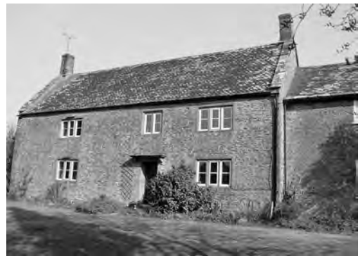
Fig. 42 West Coker, Barton Farmhouse

The house is detached and no longer part of a farmstead (Fig. 42). It has three rooms in line and a cross-passage plus additions on the east gable with other minor buildings. There is a blocked first-floor pointed-arch window with tracery on the west gable, which together with the wall thicknesses and the remnants of the arch-braced trusses (on which there is no smoke blackening) indicate that this was a high-status house dating from the 15th century. It is conjectured that then it comprised a hall, incorporating a lateral fireplace and winding turret stair, and a screens passage along the west side of the hall with a pantry and buttery. There may have been a detached kitchen. The first floor contained a hall chamber and one or two rooms at the west end – the room lit by the elaborately traceried window may perhaps have been a chapel. In the mid 16th century the lateral stack and stair turret were removed and stacks were inserted at the gable ends, blocking the west window. The cross-passage was re-sited and the central service room created. The south front wall was rebuilt with new windows in the mid 17th century. In the early 19th century the two-storey kitchen wing was added on the east gable and new stairs were inserted. According to The Annals of West Coker (1957) by Sir Matthew Nathan, the property was known as 'Penneys tenement' and the Pennys were a West Coker family from the early 14th century and in the 15th century were tenants of Glastonbury Abbey.