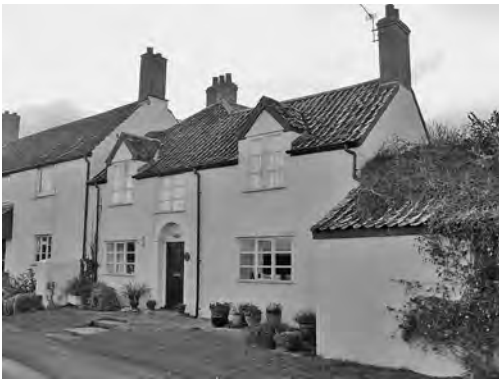
Fig. 12 Stogursey, Burton, Knighton Cottage

The two-room plan has a central entry into a stair hall and additions at the rear. The front range (Fig. 12), comprising kitchen, stair hall and parlour, dates from the 18th century. However, what appears to be the remnant of an earlier roof truss suggests that the property may be a rebuilding of that time. Also the proximity of the truss to the present party wall indicates that the property originally extended further to the south and was demolished when the adjoining cottages were built. A single-storey extension to the north was added in the mid 19th century, probably as a carpenter's workshop, as the house was occupied by a carpenter at the time of the 1841 census.