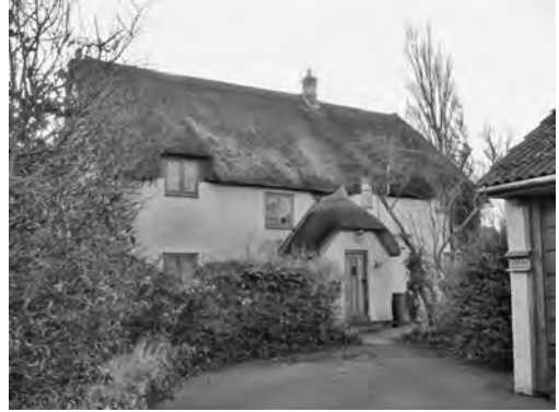
Fig. 28 Stogursey, Knighton, Eton Cottage

The wall thicknesses, roof structure and details suggest that the house (Fig. 28) dates from the early 18th century and was then one-and-a-half storey comprising living room/kitchen, and a service room, with access directly into the living room. The fireplace lintel has the remnants of inscribed circles, which are probably witch (apotropaic or ritual) marks. The lean-to rooms at each end are probably contemporary. There have been modern additions.