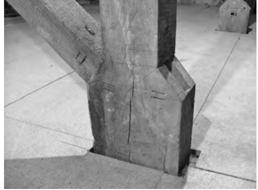
Fig. 23 Stogursey, High Street, No. 2, carpenters' marks