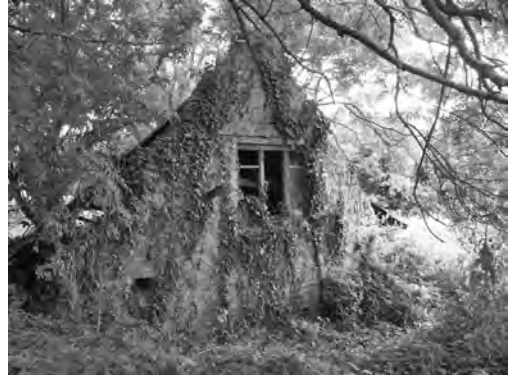
Fig. 38 Stogursey, Wick Mill