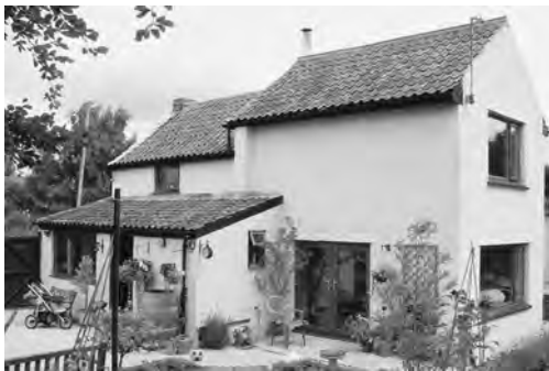
Fig. 41 Stogursey, Wick, Zine Cottage

The L-shaped plan comprises two rooms with a lean-to addition at one side and a rear wing (Fig. 41). The limited evidence available – the plated-yoke roof trusses with the tusk-tenoned purlins and other details – suggests that the two front rooms were built c. 1800. At that time it is likely that the cottage was either a two-unit dwelling or formed an integral part of the adjoining property and may have been a workshop. The large rear wing was added within the last 50 years. For the derivation of the unusual name see SANH 151 (2008), 197.