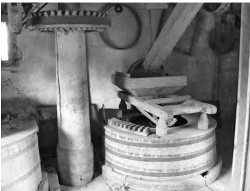
Fig. 16 Stogursey, Castle Street, Town Mill, stone- floor