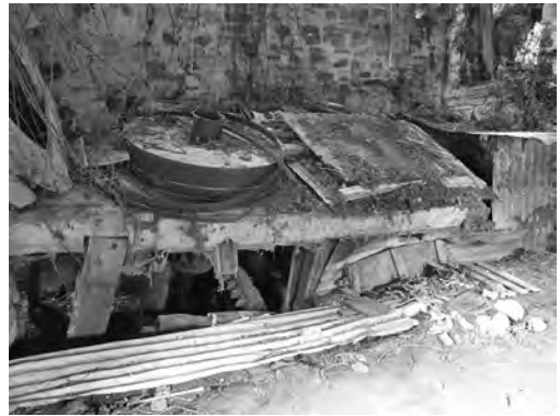
Fig. 39 Stogursey, Wick Mill, interior

site is an ancient one and can be positively identified as existing in 1301, and the mill appears on the survey map compiled for the Earl of Northumberland between 1609 and 1614, which shows the watercourses in the same positions as those appearing on the 1841 Tithe Map. The wheel-pit has been backfilled, but it is possible to determine that the wheel was over-shot. A photograph of 1975 by Derrick Warren of the Somerset Industrial Archaeology Society, who made a measured survey, shows the machinery in surprisingly good condition for its apparent age, which would be considered early from its archaic appearance, being made entirely of wood (Fig. 40). However, documentary evidence indicates that the gear was renewed in 1887, but this must have involved replication of the existing machinery. That this archaic form of machinery, which is typical of medieval water mills, survived into the 20th century is exceptional and presumably results from a long tradition of continuous economic repair.