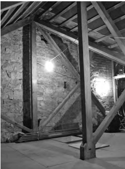
Fig. 22 Stogursey, High Street, No. 2, king-post truss

The house is one room deep with a small off-set extension to the rear. A newel stair gives access to the first floor (Fig. 24). The thick front wall and the form of the door suggest a 17th-century date and parts of the roof structure may also be of this period. The relationship of this house with its neighbour is unclear, as the upper floor front wall thickness indicates 19th-century construction and this, together with the similar wall thickness of the adjoining house, may imply reconstruction or adaptation of non-domestic buildings.