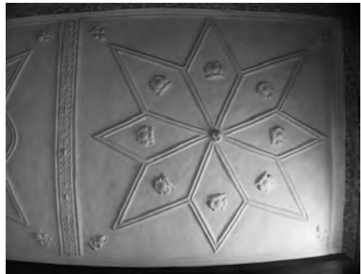
Fig. 11 Stoke St Mary, Haydon Farm, parlour ceiling

mouldings (Fig. 11). The pattern and details suggest a late 16th-century date, but presumably it is an example of a plasterer following an archaic style. The undecorated panel is probably the result of alterations to the fireplace. The lean-to service room, perhaps a dairy, and the two-storey addition date from c. 1800. A further addition to the kitchen was built before 1887 (when it appeared on the OS map). A comparison between the Tithing Map of 1840 and various OS maps – together with the structural evidence that survives – indicate that much of the farmstead existed by 1840. The size and variety of the buildings show that this had been a large mixed holding from the early 19th century with an emphasis on dairying and cider production. Interestingly teazles were also an important crop. Among the more significant farm buildings are a cider house, formerly with a press, horse-gin and apple loft, a threshing barn, hay barn, stables, cart shed, wagon house, trap house, sheep houses, calf houses and cow sheds.