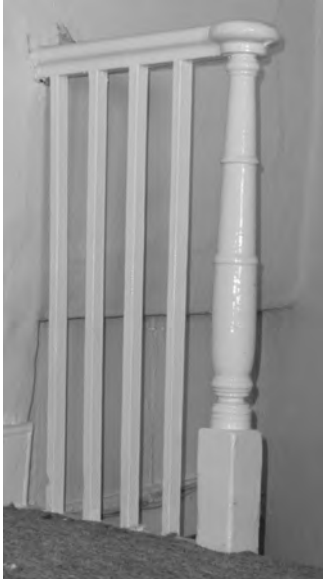
Fig. 24 Stogursey, High Street, No. 15, stair newel and balusters