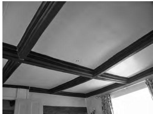
Fig. 6 High Ham, Hillbourne, framed ceiling

6) and the jointed-cruck truss (Fig. 7), a 15th-century date is suggested (compared with similar dendro-dated structures in Somerset). There is evidence for the existence of a smoke-bay, which implies that originally this was the service end of a larger house, although the full extent is not clear. Later in the 16th century the hall and cross-passage were built and the smoke-bay was superseded by a fireplace. The roof structure is also supported on jointed-cruck trusses. The house then comprised two units, as the inner room may have been a single-storey lean-to, raised to full height probably in the 18th century. An adjoining 19th-century shop was demolished in recent years. The house was originally part of a farmstead, with two barns surviving – one converted into a house and the other being an early 19th-century threshing barn, much altered in the 20th century. The Tithe Map and Apportionment of 1841 shows that the holding was a mixed farm which warranted the substantial threshing barn and other buildings which existed at that time.