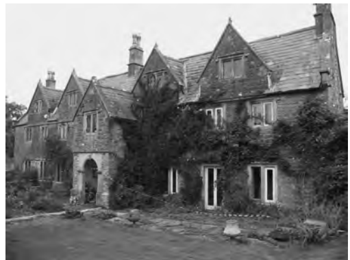
Fig. 3 Farrington Gurney Manor House

The house has been much altered and extended but the original south range (Fig. 3) is a symmetrical seven-bay block with a central two-storey porch dated 1637 with the initials of the builder Richard Mogg. Built of squared and coursed rubble with stone dressings, it is two storeys with attics, the attic windows in gabled dormers with apex finials. The house then had a U-shaped plan, confirmed by an estate map and survey of 1795, which described the holdings of the Prince of Wales in Farrington Gurney (the estate having belonged to the Crown from the early 14th century). The rear courtyard was infilled probably in the 18th century and the east wing was added in the 19th century. The Manor House descended in the Mogg family until 1930.