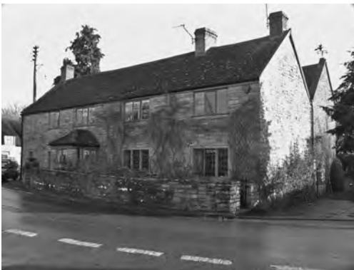
Fig. 8 Muchelney, Parsonage

The house (Fig. 8) is of two storeys with three rooms in line and an entrance/stair hall and additions at the rear. Based on the surviving details, the date of building appears to be c. 1600. At that time it comprised a hall, with framed ceiling and a fireplace