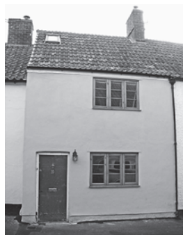
Fig. 33 Stogursey, St Andrew's Road, No. 10

The house (Fig. 33) has a rectangular plan and is the eastern half of a pair of houses butted to the properties on either side. It is entered directly from the street and has a principal room containing the fireplace. A lean-to at the rear houses the stairs and provided a kitchen/service room. Probably it was constructed in the early 1800s and has remained largely unaltered.