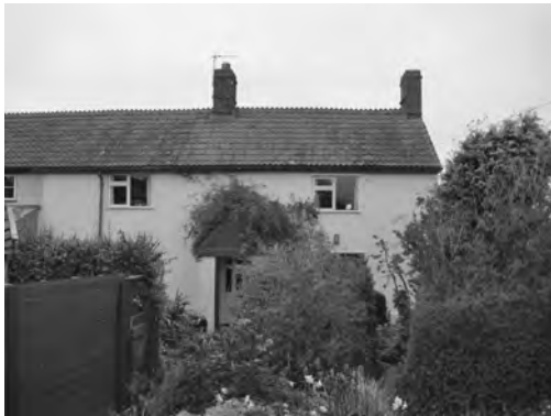
Fig. 30 Stogursey, Knighton, Hill View

This is a two-storey end of terrace cottage (Fig. 30) with two front rooms divided by an entrance passage with a lean-to addition at the rear. Dating from the early 19th century, originally it comprised one ground-floor room with a room above, with either a front or end-gable entry. By the time of the 1886 OS map it had been extended and later in the 19th or early 20th century the roof and lean-to were raised to provide additional accommodation.