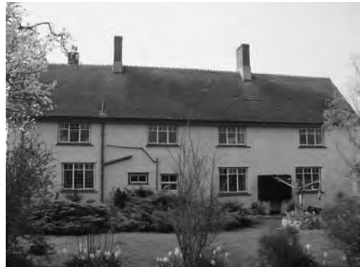
Fig. 36 Stogursey, Stolford, Woolstone Farm

The large farmstead stands in an isolated position at the eastern end of the parish close to the boundary with Stockland Bristol. The farmhouse (Fig. 36) was severely damaged by fire in the early 20th century and only part, comprising three rooms, survived, subsequently much altered and with substantial additions. Historically this was the capital messuage of Woolstone Manor, the descent of which is detailed in the Victoria County History ( Somerset, VI (1992), 145). The farm buildings have also been extensively adapted, but originally included a linhay, barn, cowshed and piggery. A substantial two-storey granary survives and on the 1886 OS map appears to have a wheel pit, which probably had a supply of water from the pond to drive a wheel for milling, grinding, etc.