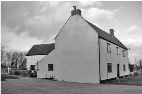
Fig. 37 Stogursey, Wick House Farm

The house (Fig. 37) comprises a two-room plan with a wide central stair-hall and an outshut at the rear. A long rear wing beyond has an inner room, which may always have been domestic, and the outer room is reputed to have been a granary with storage below, now converted to domestic use. The beams, roof construction and fireplace design suggest a date in the late 17th or early 18th century for the front part of the house. At that time the stair-hall may have been an unheated service room, but if so the original position of the staircase is unclear. The rear wing is likely to have been built in the later 18th century with the staircase rebuilt at that time and the service room relocated to the wing. The parlour may have been updated at the same time. The rear lean-to may have been added as a scullery/wash-house at this time or in the early 19th century, as it appears on the 1841 Tithe Map. A full history of the farmstead has been compiled from documents in the Somerset Record Office, which indicate that in 1609–14 it was part of the Earl of Northumberland's estate and a contemporary survey map shows the house with an adjacent octagonal dovecote. A surveyor's report of 1869 list other farm buildings including a barn, linhays, stables and a wagon house.