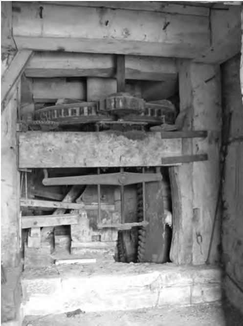
Fig. 15 Stogursey, Castle Street, Town Mill, hurst