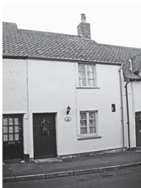
Fig. 32 Stogursey, St Andrew's Road, No. 6

comprised a single unit with a small service room. The accommodation duplicates that of the adjoining house, No. 7 (see SANH 151 (2008), 195) and suggests that they were probably built as two separate single-unit cottages. However, in the mid 19th century – based on the 1841 Tithe Map and Apportionment and Census – they were being occupied as one house. By the time of the 1886 OS map they had reverted to separate units.