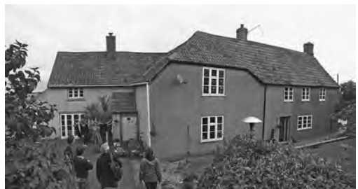
Fig. 26 Stogursey, Higher Monkton Cottage

The plan form of the building is of two east–west ranges (Fig. 26) which are misaligned and overlap each other, the southern range being slightly larger overall. This range is set to the east of the other and has a barn range projecting northwards at its eastern end. The land falls away steeply on the north side of the north range, which is one-and-half storey with a single-storey lean-to at its western gable. Originally of two-room and cross-passage plan, the central passage has porches added front and rear. The south range is also one-and-half storey with a two-room, cross-passage plan form. However, over the west room the roof is aligned north–south and both ground and first-floor rooms have higher ceilings. The chamber ceiling has moulded plaster decoration and