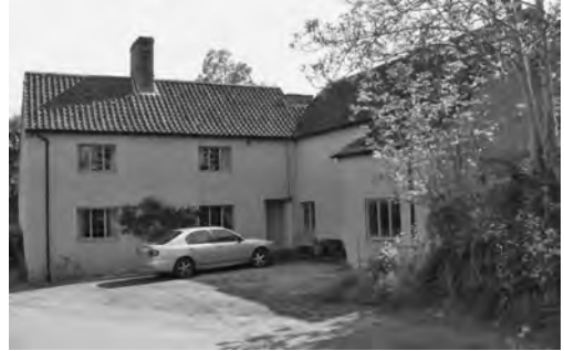
Fig. 13 Stogursey, Castle Street, Town Mill

The mill is situated north of the castle and utilises the water system supplying the castle moat and the overflow from St Andrew's Well along the rear of the burgage plots. The leat runs north from the moat in an open channel along the rear of the mill and was diverted south via the launder (trough) onto the waterwheel. The mill is a two-storey building (Fig. 13), attached to the Mill House, with a single-storey extension on the front elevation and an iron overshot wheel (Fig. 14) on the northern gable. The ground (or meal) floor houses the timber hurst frame (Fig. 15) which carries the pit wheel, wallower (gear), spur wheel and the two stone nuts. These nuts drive two pairs of millstones at first-floor level (Fig. 16). The upright shaft also drives a lay shaft at this level, via the crown wheel and pinion, which powered the sack hoist and flour grader or dresser (no longer present).