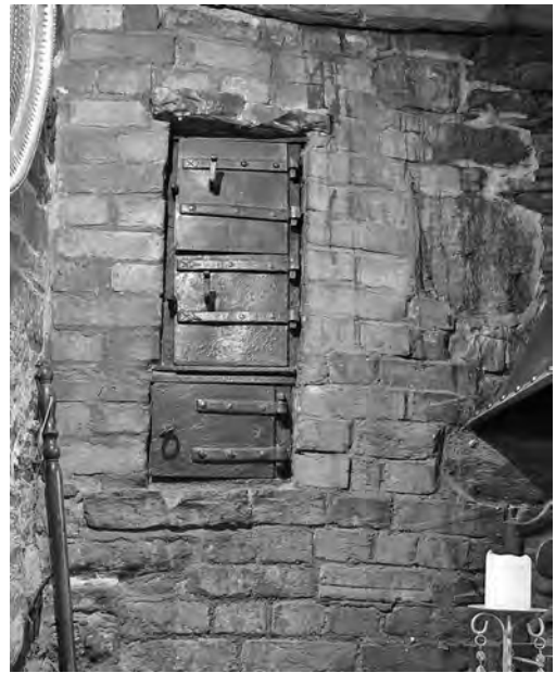
Fig. 9 Muchelney, Parsonage, summer oven

with curing chamber and oven, cross-passage and an inner room, then unheated. The details of the roof trusses indicate that the house was substantially altered in the mid-18th century (perhaps when it became a parsonage). The curing chamber became disused and service stairs complete with lantern window were inserted; a new fireplace and stack were inserted in the hall; the original stairs were removed and new stairs built creating a stair hall; the inner room became a parlour with the addition of a fireplace; and the walls were raised and the roof rebuilt. Late in the 19th century the two-storey additions were built, perhaps as a dining room and cellar/pantry. The summer oven in the kitchen may also date from this period (Fig. 9).