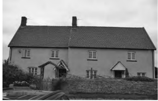
Fig. 20 Stogursey, Farringdon Hill Farm

The house (Fig. 20) is detached and overlooks the farmstead. It is three rooms in line with cross-passage and turret stair, with substantial additions on the north side. Documentary records indicate that the house is on the site of Farringdon manor house, but no evidence has been found of an earlier structure. The misalignment of the front wall and the change in roof pitch suggest that there were two building