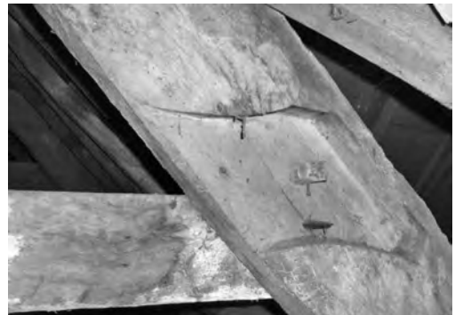
Fig. 18 Stogursey, Castle Street, No. 8, reused roof timber