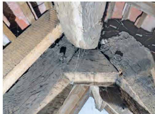
Fig. 5 Apex with later ridge purlin

The cross-passage is now in no. 12 as was the outer room. A fine medieval door frame may be original to the house (Fig. 7). On entering, there are remains of a screen between the cross-passage and the former