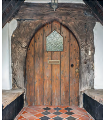
Fig. 7 Medieval door frame

open hall (Fig. 8). In the framing is a small section of a formerly shoulder headed door frame which would have led into the open Hall.