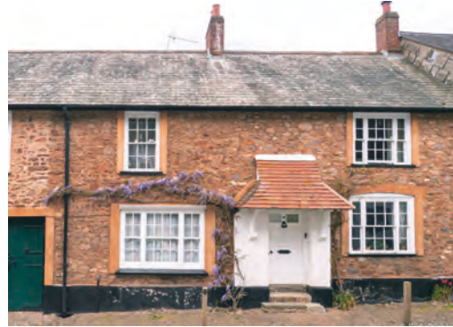
Fig. 15 Front elevation of no. 18

The plan of the house is not at all regular and