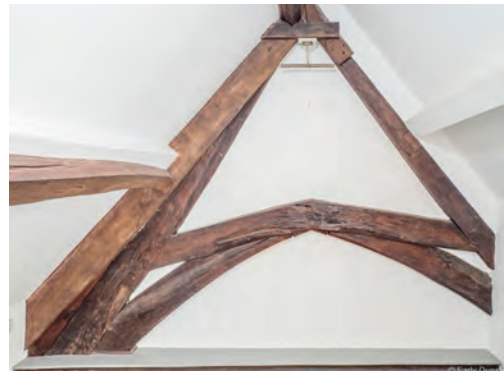
Fig. 4 Top of arch braced truss