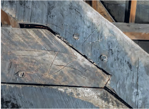
Fig. 18 Collar joint cut into principal, truss t1