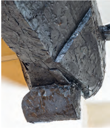
Fig. 6 Floor beam in no. 14