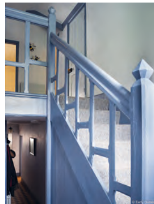
Fig. 17 Staircase details, no. 18

seems to have been rebuilt around earlier fabric. This is also likely from the amount of re-used timbers built in to the fabric, particularly at the rear. The