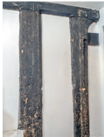
Fig. 8 Remnant of shoulder headed door frame in former screen

In the main block (block 1) to the north are remnants of two trusses with collars buried in the