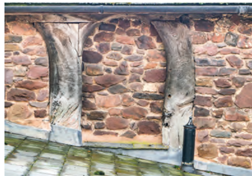
Fig. 20 Extant external framing

Another interesting feature is a remnant of external framing above the rear extension roof of no. 20 at what was the junction between the two ranges (Fig. 20). The curved heads are reminiscent of a doorway in an external timber framed house in Kent (Banwell