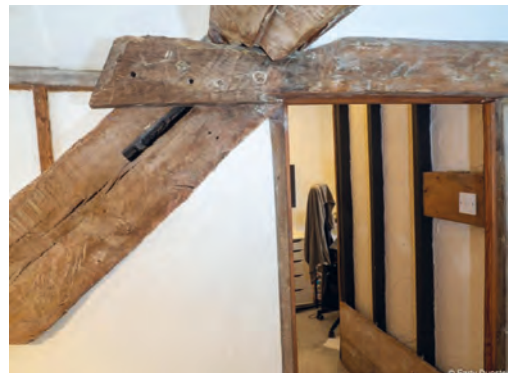
Fig. 12 Reused timber stair support

The next block on the High Street to the south (two storeys), has a comparatively modern roof which was probably built at the same time as the rebuilding of the former market house to the south (late 19th century). This block has a little bay window with pent roof on the front elevation (Fig. 13). A wide opening was knocked in the now internal wall between the two blocks on the ground floor front, this now forming a larger shop. The access to the rest of the premises (a dwelling) is in this second block.