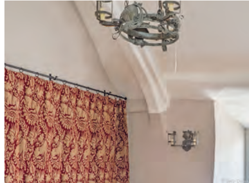
Fig. 3 Lower section of arch braced truss

The plan of no. 14 includes the open hall and inner room of the original burgage plot. A huge (36 x 40cm) beam supports the first floor and was altered at the east end when a lateral stack was inserted in the back wall (Fig. 6). A similar, but smaller, half beam is now partly against an inner wall. Major alterations were made in the 17th century, including a new entrance door opening, door and frame and runs of ovolo moulded windows to each side of the party wall.