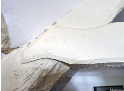
Fig. 14 Notched half lap collar joint

it has a convenient chalk mark with the date '1858'.