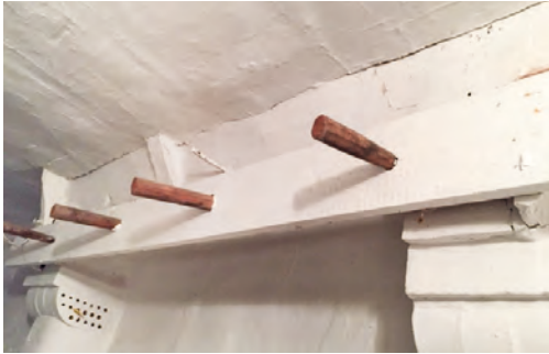
Fig. 10 Brickwork in alleyway