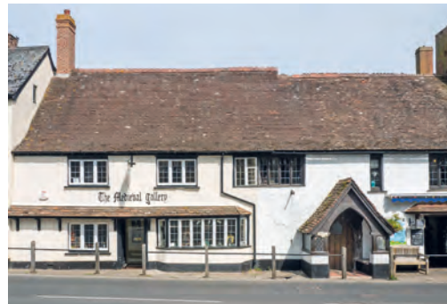
Fig. 9 Nos 12 and 14 High Street