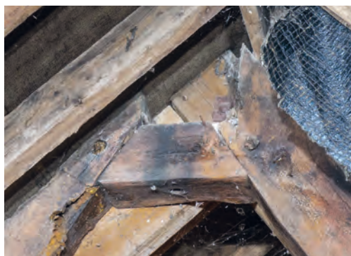
Fig. 2 Truss t3 apex

with yoke above the principals, which are tenoned into the yoke and pegged. Truss t3, by contrast, has a Type H, with yoke below the principals, and the principals extending upwards to enclose the square set ridge purlin on three sides (Alcock 1981). The south blade of t2 has an inscribed hexafoil. Truss t2 has remnants of rush-based plasterwork infill above first-floor ceiling level, probably dating to when the house was divided into two properties with staircase inserted at each end. It is now all one house again.