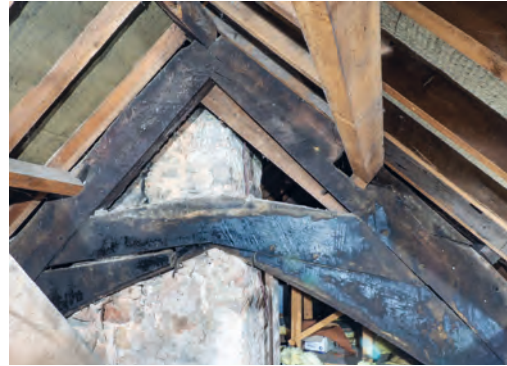
Fig. 19 Truss t2

rear of no. 16 faces directly on to the garden of no. 18 and it has been completely rebuilt and extends beyond the earlier site. No. 20 has the main rear wall mentioned above (as in Fig. 16) running through it, although the stonework has been extended to the rear to accommodate a kitchen. Internal lintels suggest former wider openings with later adaptations to make a separate house. There is a flying freehold over the walkway to the back gardens. In the rear garden is a small barn which is now divided into two between no. 20 and no. 18.