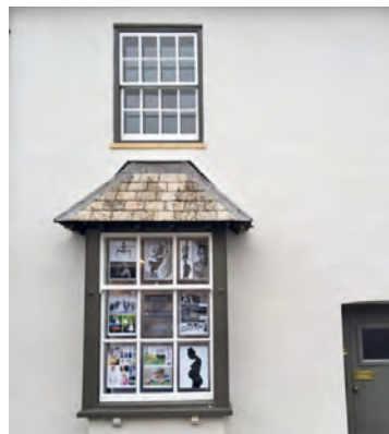
Fig. 13 Ground-floor bay

His survey here only covered no. 8, but the presence of a thick rear wall in no. 6 confirms his conclusion that this was a three-room cross-passage house with rear lateral stack to the service room as at 15/17 Marsh Street. Features in no. 8 suggest that it was raised to a three-storey height in the 17th century. The roof for this has a notched half lap joint comparable to others found in Somerset at that time (Fig. 14).