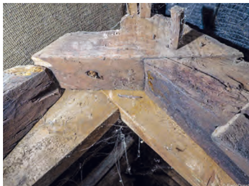
Fig. 1 Truss t2 apex

This is a three-room cross-passage house with four bays and dendro-dating by Andy Moir of Tree Ring Services (Moir 2018, 125) on behalf of Time Team, gives a felling date range of between 1299 and 1321. Two of the trusses are true or raised crucks and two of the principals are extended; one of these extensions at least appears to be original, but it is hoped to clarify that with further dendro-dating. The third truss (t1) is a jointed cruck, joined at the elbow in the usual way, but it has been replaced above first-floor ceiling level. The trusses have cranked collars but not arch braces as stated in the tree ring report. Wind bracing, however, is in evidence over what would have been the open hall. The two trusses t2 and t3 have different apex types (Figs 1 and 2). Truss t2 has a Type C apex,