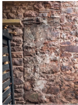
Fig. 16 Former door jamb