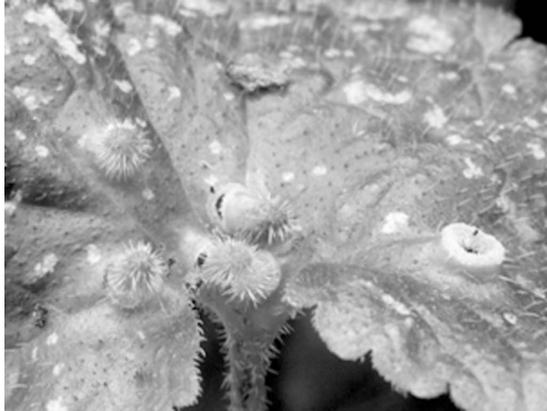
Fig. 5 'Lighthouse' galls on Ground-ivy ( Glechoma hederacea ) caused by the gall-midge Rondaniola bursaria

Co-ordinator for plant galls in Somerset. We have been doing much to promote an interest in plant galls within SANHS. In the last two years, there have been joint field meetings in Somerset between SANHS and BPGS – at Shapwick Heath and Uphill – and we try to keep a record of plant galls encountered on all our summer excursions. Several locally rare (or under-recorded) plant galls have been found during SANHS meetings. For example, on the Society's visit to Priddy Pools (ST5451) members were delighted to see the distinctive large cigar-shaped galls of the gall-fly Lipara lucens on Phragmites australis (Common Reed).