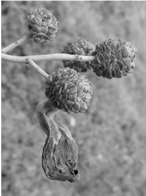
Fig. 3 Alder 'tongue gall' caused by the fungus Taphrinaalni

Anyone who gets a thrill from filling in gaps on maps will therefore find plant galls a particularly rewarding field of study. And a stroll in the Somerset countryside at almost any time of year should produce a list of perhaps twenty to thirty