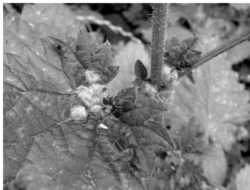
Fig. 1 Galls on Stinging Nettle ( Urtica dioica ) caused by the gall-midge Dasineura urticae

Uromyces geranii which causes distinctive small swellings on the leaves of at least half a dozen species, all of them crane's-bills ( Geranium species). This host specificity is a huge help when it comes to identifying a mystery gall, allowing one to produce a shortlist of likely gall-causers once the host has been named.