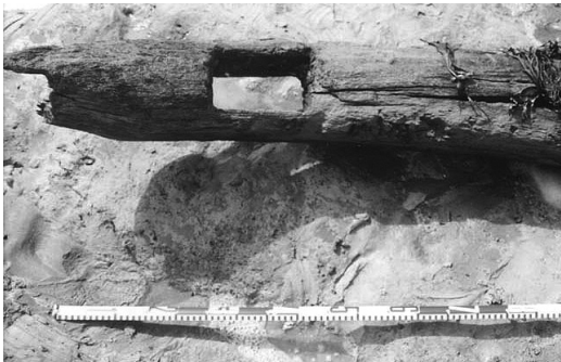
Fig. 3 Part of the undated timber, NB remains of second transverse mortice at left, chamfered, end

This is the second timber with mortices cut through it to be recorded in Porlock Bay. The first was found in the Tidal Pond in 2001 and since it was not only unstratified but awash in the sea it was not retained (McDonnell 2002a). It should be noted, however, that at this time the breach stream flowed into the tidal pond. This item was 2.4m long with a branch 1.19m long which had a splintered end; the bole was 180mm diameter below the branch (Fig. 3). The base had been chamfered on both sides to form a two sided, wedge-shaped end and had been worked with a straight-edged tool. The record shows very similar, roughly cut mortices, through the thickness of the wood at a comparable scale. It is possible that these two items come from the same or similar, local structures.