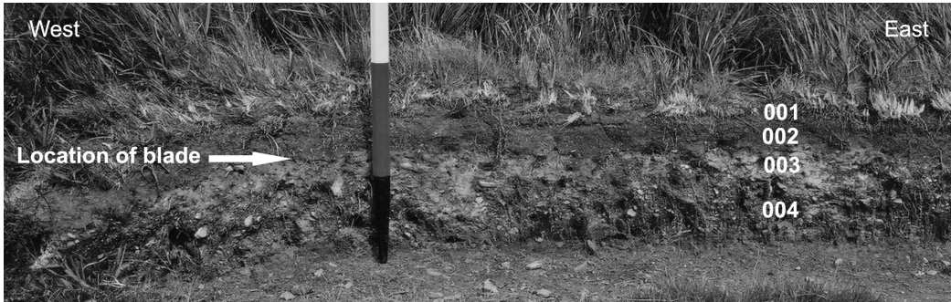
Fig. 1 Soil profile; scale division 0.2m

0.54m wide, horizontal bench; it was cut 0.32m deep on the northern, rear, upslope side. The regularity of the scrape suggests that it may have been a recent, anthropogenic feature cut specifically to clean back a section of the soil profile and then subsequently used by sheep to shelter against (Fig. 1). The soil profile so exposed comprised four visually identified units here described from the top down.