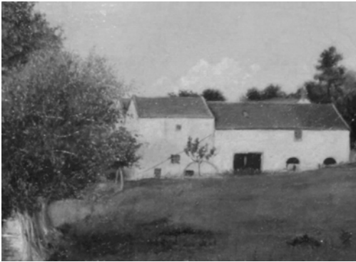
Fig. 4 Bleadney Old Mill, oil painting c. 1900

Bleadney Old Mill was the site of the manor mill of Wookey. Its tenant bought it in 1679 and after a further 100 years as a grist mill it was converted in 1784 to papermaking by John Band of Wookey Hole. It was run by a succession of papermakers until 1850, notably the Horsingtons who were influential in Wookey parish. A painting of c. 1900 (Fig. 4) faintly shows the vertical timbers of the added top floor drying loft embedded in the walls – these are still visible today.