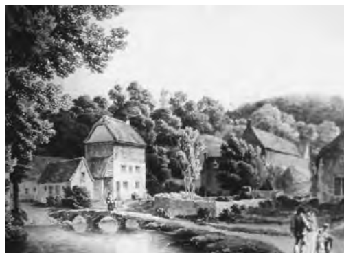
Fig. 2 Wookey Hole mill c. 1800

Wookey Hole is the earliest known paper mill in Somerset with its first documented lease for papermaking dated 1610 (Table 1). Its documentary record is good because, for 400 years, it was the property of Wells Old Almshouses. By the end of the 18th century it consisted of a typical three-storey mill, driven off the west leat from the river, with an additional drying loft, the maker's house and various other sheds. An etching of c. 1800 (Fig. 2) from a painting said to be by Michelangelo Rooker, shows the mill right of centre and another loft to the left.