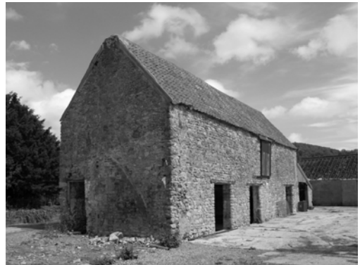
Fig. 5 The drying house at Dulcote West mill