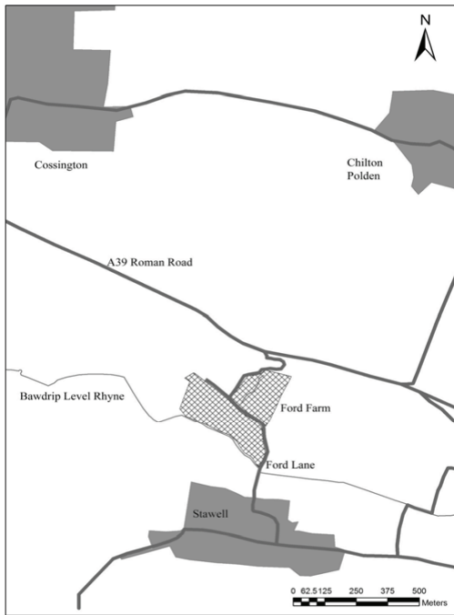
Fig. 1 The Ford Farm site on the southern slope of the Polden Hills

presence of tufa rock and springs also on the site may be significant. Leach (2001, 84) uses the term ‘native landscape’ to describe Somerset during the Romano-British period, dependent upon a rural, pastoral economy. The range of artefacts which comprise the assemblage is dominated by pottery but also includes animal bone, plaster, coins and other metal finds, including brooches.