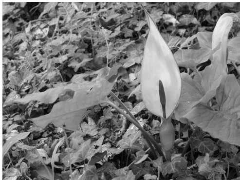
Fig. 3 Lords-and-Ladies ( Arum maculatum ), Corfe

( Hyacinthoides non-scripta ) on the 9 th , Lords-and-Ladies ( Arum maculatum ) (Fig. 3) on the 13 th and Hawthorn ( Crataegus monogyna ) on the 29 th , all these are species that Watson would have expected to start flowering in the second or third weeks of April, and all were significantly earlier in 2012 than in 2011. This early onset of flowering was doubtless a response to the extended period of exceptionally sunny, dry and (most importantly) mild weather in late February and March.