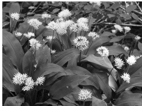
Fig. 2 Ramsons ( Allium ursinum ), Sherford

For all these groups the mean FFDs were the earliest since observations began in 2008 (Table 1). Spring-flowering species coming into flower in March, much earlier than usual, included Wild Garlic ( Allium ursinum ) (Fig. 2) on the 3 rd , Bluebell