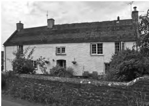
Fig. 15 Winscombe, Laurel Farm

Plan: three rooms in line with two rear wings (late 19th- and mid 20th-century). The random rubble local stone walls, slobbered with white coating, rise to two storeys under a double roman clay tiled roof. Based on the wall thickness, 60cm, and truss construction (ridge piece jointed with a halved joint as has been noted at 3 other properties in the parish) it is suggested that the core is a mid 16th-century two bay, one and a half storey dwelling with a fireplace in the east gable. Mid/late 18th-century a westward extension included a new fireplace on the west gable, with a rounded 'D' shaped internal stack, this replaced that in the rebuilt east gable. About 1800, a further westward extension appears to have been constructed as separate accommodation (own entrance door and inglenook fireplace) but with a similar roof construction to the earlier extension. Later the 2 properties were integrated, the south eaves were raised and a new roof replaced the earlier structure. (Fig. 15)