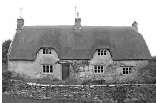
Fig. 3 Longburton (Dorset), Spring House

Plan: three-rooms in-line and one-and-a-half storeys with a 2-storey north wing. (Fig. 3) The rubble-stone (Forest Marble) walls have an internal inward-sloping batter. The thatched roof is supported by three long-tenoned side-pegged jointed-cruck trusses. The principals are joined by cambered collars with a straight-cut mortice-and-tenon apex joint. Curved wind-braces sit between the lower and upper purlins. All joints are wood pegged. A 15th-century date of build is suggested; smoke blackening and