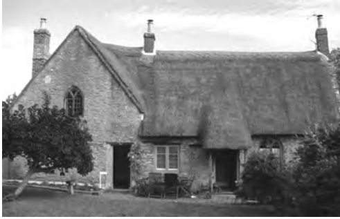
Fig. 2 East Coker. Moor Lane, Chapel Cottage & St. Roche Cottage