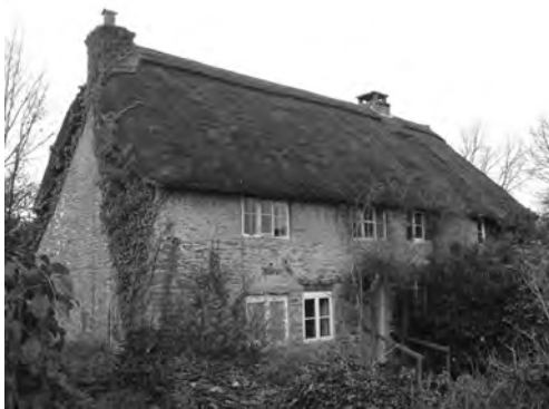
Fig. 4 Longburton (Dorset), Well Cottage

truss with former trenched-purlins, two fireplaces with slightly cambered timber lintels and 4 -5 cm chamfers, the beams (6 - 8cm chamfers with run-out and/or shallow step and run out stops) and the 68-75cm thick rubble-stone walls under a thatched roof indicate an early 16th-century date. (Fig. 4) In the mid 19th-century the walls and roof were raised and the north end room and additional windows inserted creating accommodation for two households.