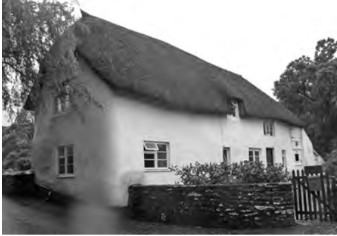
Fig. 21 Wootton Courtenay, Bridge Cottage

rendered over rubble stone and cob), 8 cm deep chamfers with cyma-stops on beams, remnants of jointed-cruck trusses. In the mid 19th-century it functioned as an Inn. (Fig. 21)