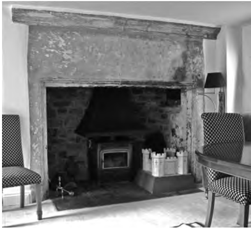
Fig. 16 Winscombe, Wellage Cottage Court

Plan: four rooms in line rising to one and a half storeys with a single storey addition. The walls, 50–70cm thick, are rendered and painted under a pan-tiled roof with a common ridge height but two different eaves levels. The open hall core of the house dates from around 1500; based on smoke blackening, truss construction, 3cm chamfers on the purlins and remnants of wind bracing. A closed (wattle & daub) truss indicates a solar over an inner room. Mid 16th-century fireplaces were inserted in the hall and inner room (fig. 16) and the ground floor was ceiled.