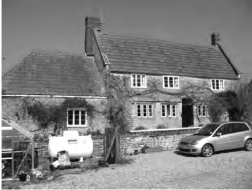
Fig. 10 Adber, Batson's Farm

N wing was constructed with ground floor as buttery/cellar and rooms above. Attic areas were fenestrated for use as servant accommodation. Mid 17th-century a cheese room (accessed via the redundant curing chamber) with cheese loft over was built as an in-line extension; parts of the N wing now being used as a dairy or cider cellar. In the 19th-century the cheese room and loft were converted to domestic use.