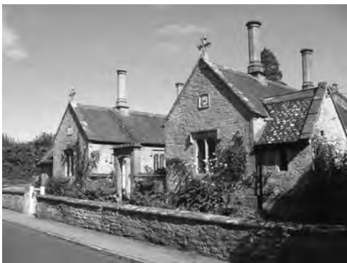
Fig. 14 Trent, Mary Turner's Almshouses

and an apotropaic mark on the lintel); doorway D2 (Ham-stone surround with ogee-step-hollow moulding terminating in a shallow stop). This early plan was hall, opposing doors indicating a crossway, and 2 service rooms divided by a lateral partition, all 2-storey. Late 16th-century the south elevation was re-fenestrated and the walls slightly raised necessitating new roof structure; a new partition defined the cross passage and a stair turret was inserted at the end of it. The hall became the kitchen, with a large baking oven. A gable fireplace was inserted in the former service area to create a parlour. Documents suggest that the property became a farmhouse during the late 18th-century and a 2-storey addition, now gone, built ca 1800 provided a dairy and additional accommodation.