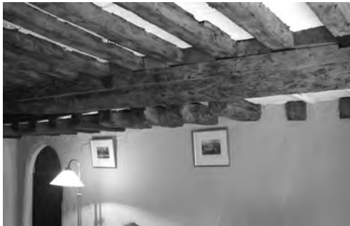
Fig. 20 Winscombe, Hale Farm jetty

the western most room which is two-storey with a cellar beneath. All elevations are painted random rubble masonry and the largely modern rafter roof, previously thatched, is clad with double-roman clay tiles. The house is set into the hillside to the north-east and the ground falls away to the west. D. Williams & F. Neale (survey 1988) suggested a possible 'longhouse', whilst not entirely negating this we think it unlikely. The oldest part of this building survives to the east of the cross passage. We suggest it was a two-unit open hall house built in the latter half of the 15th-century based on the wall thicknesses (those of the hall and inner room 65 & 76cm, some with a batter), two doors with two-centred heads and 8cm chamfers and the jettied solar chamber (fig. 20), accessed by stairs