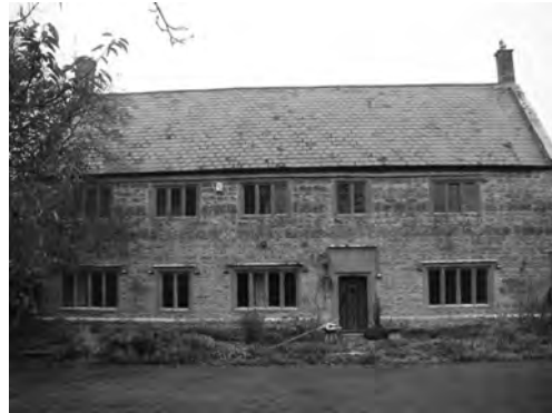
Fig. 12 Trent, The Old School House

The property was built in 1678 (a £1000 endowment in the will of a John Young of Trent to provide education for 20 sons of the poor of Trent with an additional capacity for 20 private scholars).