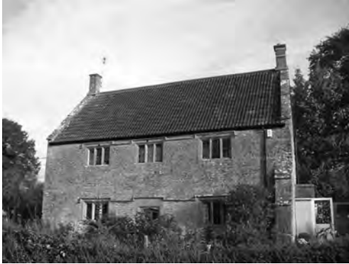
Fig. 13 Trent, The Dairy House

and an apotropaic mark on the lintel); doorway D2 (Ham-stone surround with ogee-step-hollow moulding terminating in a shallow stop). This early plan was hall, opposing doors indicating a crossway, and 2 service rooms divided by a lateral partition, all 2-storey. Late 16th-century the south elevation was re-fenestrated and the walls slightly raised necessitating new roof structure; a new partition defined the cross passage and a stair turret was inserted at the end of it. The hall became the kitchen, with a large baking oven. A gable fireplace was inserted in the former service area to create a parlour. Documents suggest that the property became a farmhouse during the late 18th-century and a 2-storey addition, now gone, built ca 1800 provided a dairy and additional accommodation.