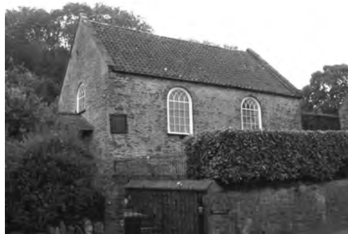
Fig. 17 Winscombe, Old Wesleyan Chapel

This building was originally a simple one-room plan and was built in 1798 on land recovered from “the waste”. Within the space there is a gallery that may formerly have been accessed by way of an outside stair. The tall round-headed windows with divided glazing bars are distinctive. (Fig. 17) The roof is constructed over three elm collar trusses, the collars being fixed with profiled half-dovetail joints. There are two tiers of purlins and the long tenon joint is rare in so far as the purlins are not off-set but