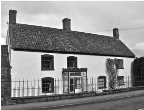
Fig. 18 Winscombe, Myrtle Farm

Plan: L shaped; the main (E-W) range is 2 storeys with attics and the rear (N-S) wing is of 1½ storeys. The 55cm thick walls are rendered and painted. The pan tiled roof, encompassing the original with 50° pitch, is set between coped gables indicating previous thatch. (Fig. 18) Original and very narrow newel stairs serve first floor and attic level; these and a bell system indicating previous servant accommodation. Built