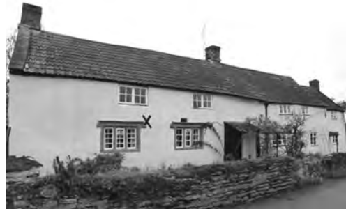
Fig. 1 Curry Mallet, Colliers & Collier's Cottage

Plan: five rooms in line with a single storey lean-to along the entire rear (north) wall. The earliest elements are an inner room separated from the hall by a post and daub partition that supports a jettied floor within the hall. In line with the jetty beam is the residual foot of a true cruck recently