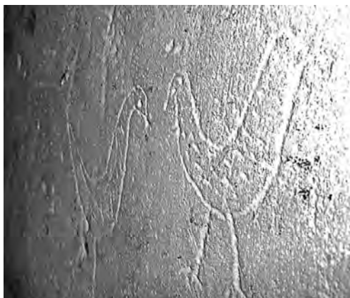
Fig. 7 North Cadbury, Brook Cottage, ritual mark on hall fireplace

Original plan: three unit (hall, central entry & unheated service room, kitchen) with gable stacks, rising to two storeys with attics. Constructed from cut and squared local lias & Cary stone with Doulling stone dressings it has coped gables and a tie-and-collar truss roof (with former butt-purlins and a threaded ridge piece) clad with double Roman clay tiles. A date of build ca. 1600 is suggested by the stylistic features (step and run-out or cyma stops and some concave chamfers on