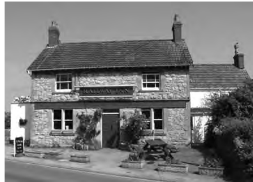
Fig. 19 Winscombe, The Railway Inn

Plan: a two storey north range and single storey lean-to rear wing, possibly a scullery, is the prime focus of our survey. Dating from late 18th-century it comprises parlour, central stair entry, and kitchen/living room. The random rubble construction walls, 55cm thick, are rendered and painted. The roof, supported on three principal trusses (feet visible in the rooms below), with cut-back and tusk-tenoned purlins is clad in double roman clay tiles. The railway opened in 1869; lodging and beer provision was necessary for constructors and passengers. The present frontage was added in the early 20th century. (Fig. 19)