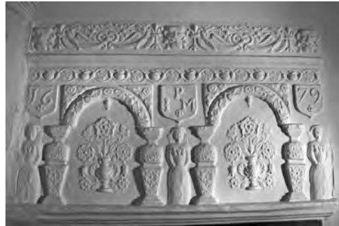
Fig. 9 1679 overmantel, Sherford House

cladding of the walls with brick; raising of the roof (collar-tie-beam trusses) and the formation of attics; installation of larger and taller windows, partitions and 'shell-style' cupboards; beams were plastered, using a Tudor Rose motif in the first floor rooms; the curing chamber was abandoned and a plaster overmantel, dated 1679 (fig. 9), inserted in the kitchen chamber. 18th-century documents indicate that the site contained a tan yard. Tanning processes probably necessitated the erection of 4 other attached 'production' rooms (one has a loft with 2 large brick 'honeycomb' vent-openings in the gable; tanned hides may have been stored here.). A date stone '1789 IW' fronts the two-storey porch. Maps from 1822 indicate a number of other dwellings and non-domestic buildings on site.