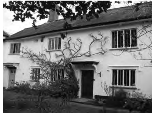
Fig. 5 Lydeard St. Lawrence, Manor House

Plan: two rooms (kitchen/living room & parlour) divided by a central passage and rising to two storeys. To the rear are two wings (the NW may be part of the original build) with an enclosed passage way between them. The early phases of development are uncertain; wall thickness, a concave chamfered beam, two of the fireplaces (F1 cambered bressumer with hollow-step-ogee chamfer, anvil stop on the orthostatic jamb, F2 5 cm chamfer & run out stops to the bressumer and pyramid stops to the orthostatic jambs) plus hood moulds over the mullion windows suggest the early 17th-century. (Fig. 5) Similarity of