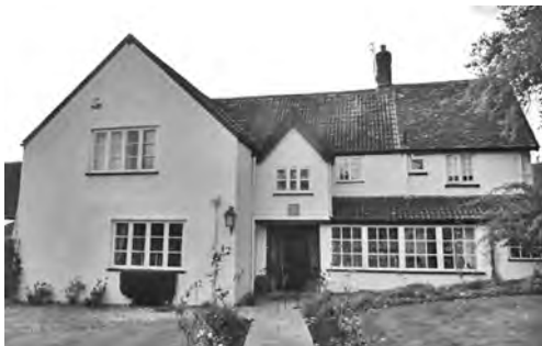
Fig. 8 Taunton, Sherford House

Plan: two-storey, with two original ground floor rooms and additions on three sides. The walls are roughcast and brick clad, over cob on the south front. (Fig. 8) A date of build ca. 1600 is suggested. Then it was one-and-a-half storey, comprising kitchen and hall with a central dividing partition. The kitchen fireplace, curing chamber and winding stairs were extant. Substantial gentrification occurred in the late 17th-century; raising and