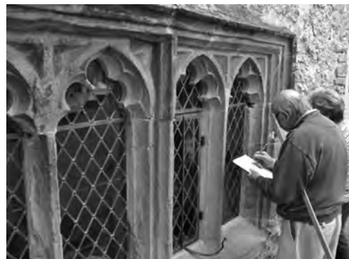
Fig. 6 Recording at Merriott, Chapel Cottage

Plan: a two-unit central entry house added to a former chapel, probably a 'chapel of ease or proprietary chapel'; both this and a rear addition