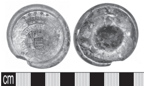
Fig. 11. Bottle seal from Merriott