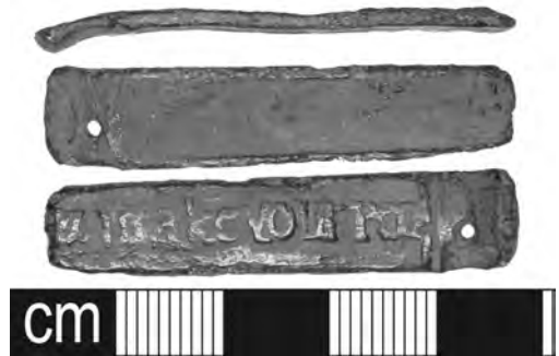
Fig. 9. Mount from Holford

The original function of the object is difficult to determine. However, the style of lettering suggests a post-medieval date, possibly of 16th to mid 18th-century date. It must be noted that the object does have a resemblance to the handles of several skillets of around this date and the lettering is very similar. However, its shape, size and delicate construction suggests that it unlikely to be related to such vessels.