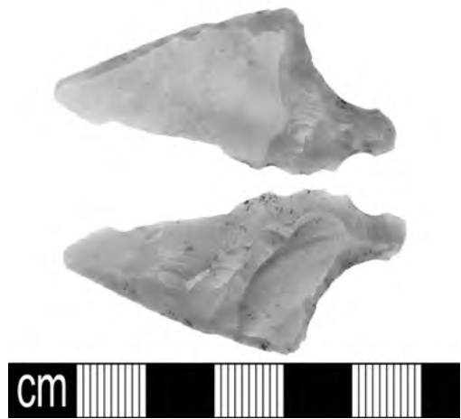
Fig. 3 Neolithic arrowhead from St Cuthbert Out

The point of maximum width is c. 27% up the blade, making this a Davis type 2, which was the largest group in his corpus (Davis 2006, 33). There is a lot of variation within this group, but this particular example appears to fit best into Davis’ variant C, which is characterised by ‘loop plates squeezed inwards, causing an indentation in the arc of the blade edge from socket to tip’ ( ibid. , 34). The development of these he traces back to the group 2 British side-looped series, whose blade shapes are