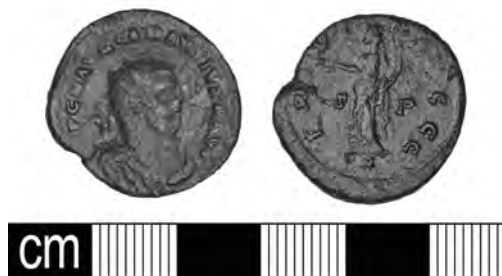
Fig. 6. Radiate from Butleigh

inscription, PROVID AVGGG, has never been recorded previously as usually there would only be two Gs at the end. The coin has now been acquired by the Museum of Somerset.