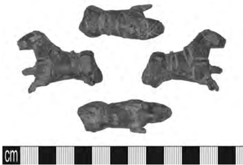
Fig. 8. Barrel lock or padlock from Stringston

A cast copper-alloy barrel lock or padlock is in the shape of a horse (Fig. 8). The lock is 41.45mm in length, 34.20mm wide, 15.20mm thick and weighs 30.9g. The horse's head is featureless, but decorated with crossed double grooves mimicking a bridle. There are two raised lines across its back and one across its neck, forming the harness and saddle. The sides and neck are decorated with thin parallel lines filled with smaller lines, perhaps to suggest armour, and one side of the neck has grooves forming a mane. The two forelegs remain, but the hind legs are missing. There are circular openings at the horse's muzzle and rump, both filled with iron erosion and a small strip of copper alloy protrudes from the horse's chest. The object appears to have been hollow and this erosion and the copper-alloy strip are presumably the remains of the locking mechanism. A similar lock, dating from the 12th to mid 13th century, was found during excavations at Winchester (Biddle 1990, 1011, fig. 313, no. 3665) suggesting a similar date for this example. This find has now been acquired by the Museum of Somerset.