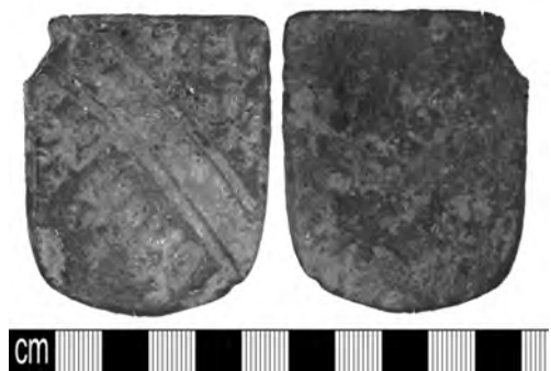
Fig. 7. Mount from Martock

The enamelled arms appear to most likely be those of the de Bohun family, which according to Burke