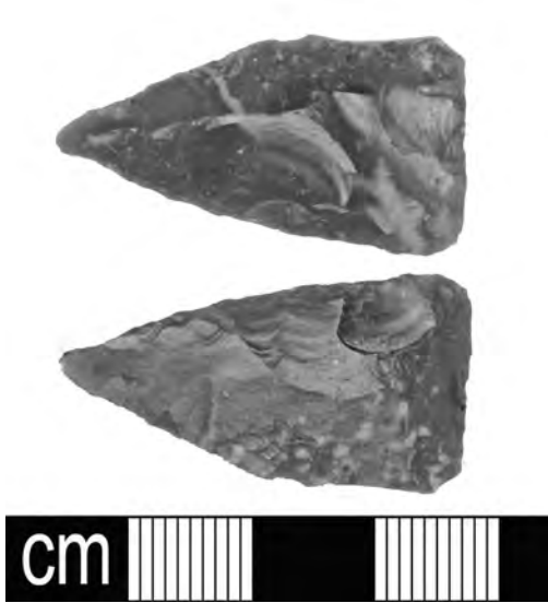
Fig. 2 Neolithic arrowhead from St Cuthbert Out

22.68mm wide and weighs 79.34g. The blade is ‘flame’ shaped with low blade ribs. The loops are incorporated into the curved base and the loop plates are squeezed inwards slightly. The midrib section is lozenge shaped in section, whilst the stem is circular, splaying slightly towards the end.