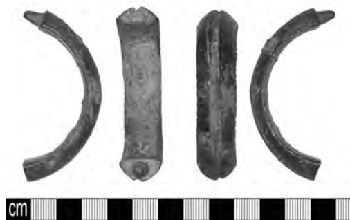
Fig. 5. Bracelet or arm ring from Westbury-sub-Mendip

(Fig. 5). The internal edge is c. 68mm in length, whilst the external edge is c. 88mm in length, the object is 7.02mm thick and weighs 46.36g. The fragment comprises around one third of a sectional circular bracelet. At one end is a deep circular recess and at the other end a similarly shaped projection, which presumably would have allowed the section to be attached to the rest of the bracelet; the projection fitting into the recess and vice versa at the other end. The exterior face of the bracelet is decorated with a crude and uneven central groove, flanked on either side by short parallel scratches. The bracelet bears similarities to several illustrated by Jope (2000, pl. 32, 33). Although these are frequently very different in decoration, most have a similar mortice and tenon attachment. A very similar example can also be seen on the PAS database from Dorset, under reference DOR-6C0200.