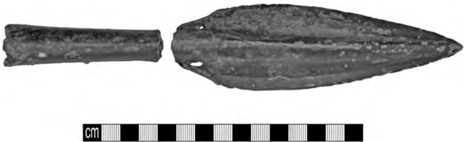
Fig. 4. Spearhead from Stocklinch

This fragment of a copper alloy circular bracelet or arm ring is probably of mid to late Iron Age date