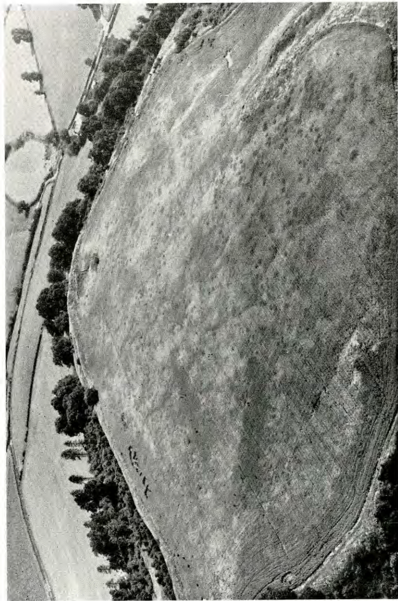
CADBURY CASTLE: VIEW FROM NORTH-WEST