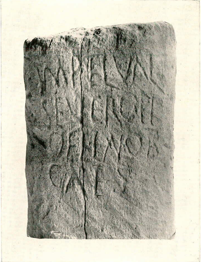
INSCRIPTION TO FLAVIUS VALERIUS SEVERUS, FOUND AT STOKE-UNDER-HAM, 1930