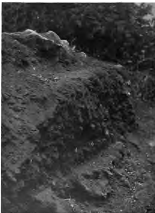
EXCAVATION OF THE FOSSE ROAD, NEAR RADSTOCK, 1904.