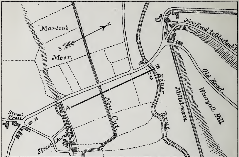
A-B Ancient Road as identified. C Site of Section.