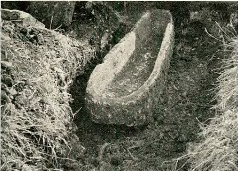
(b) The Empty Coffin.