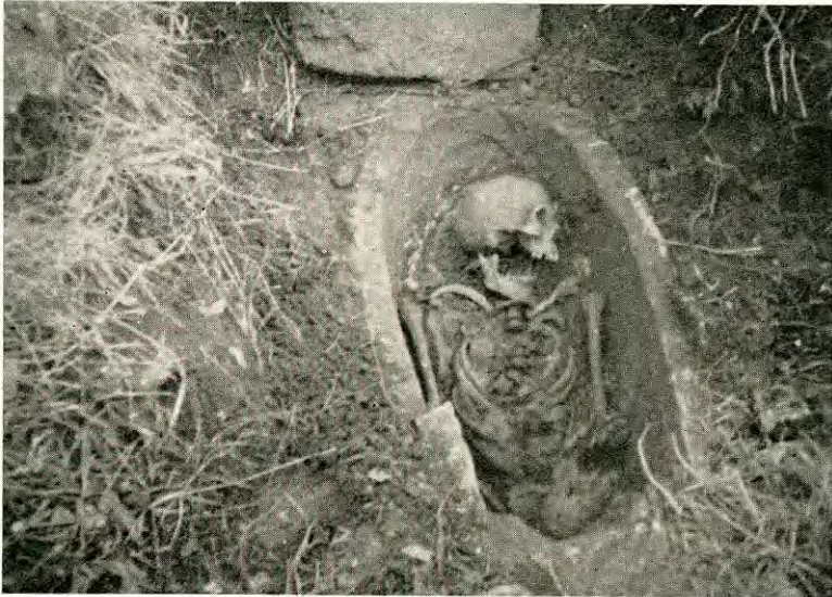
(a) Skeleton in Coffin, Wickhouse Farm, Keynsham, September, 1948.