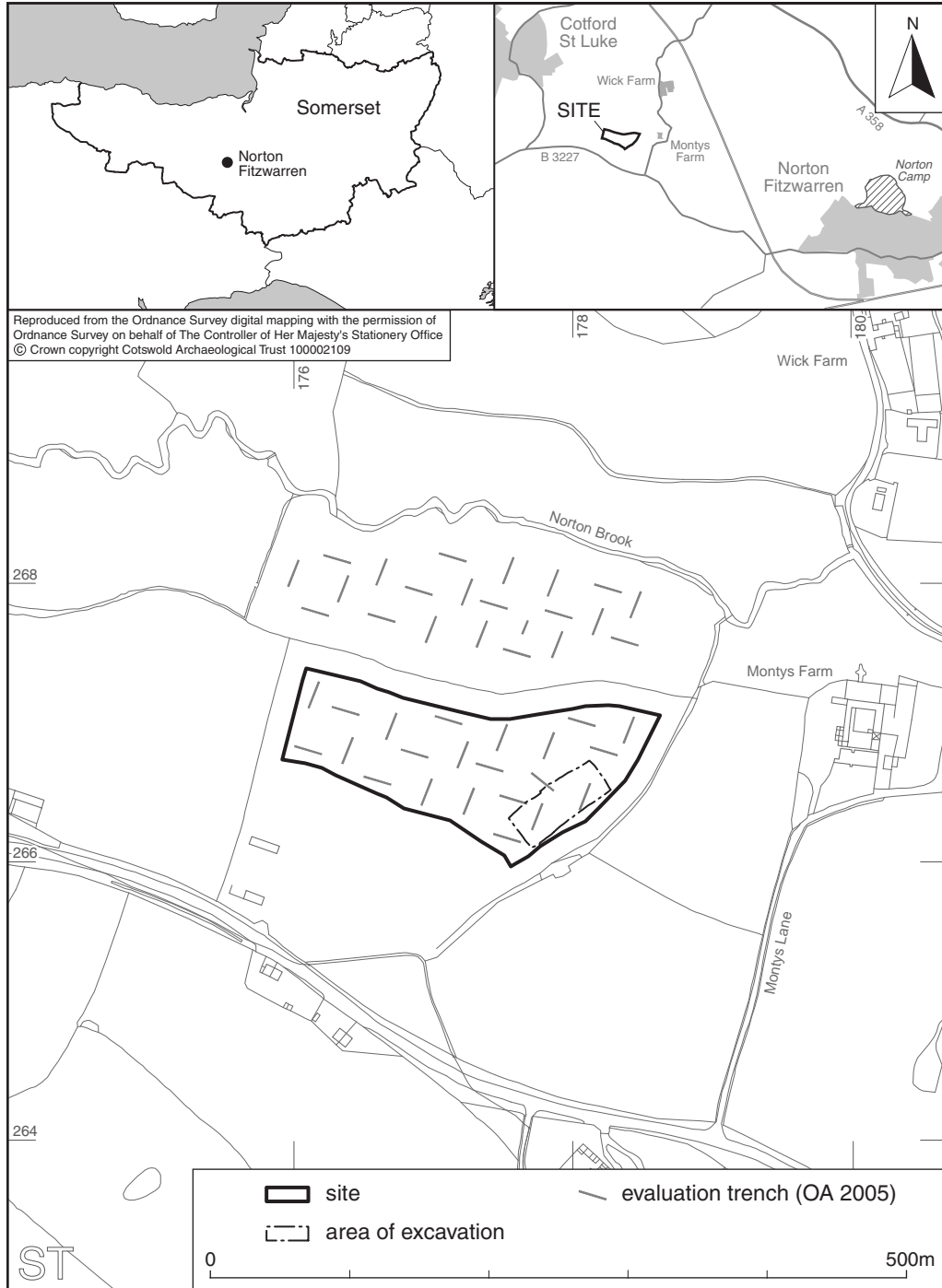
Fig. 1 Site location; scale 1:5000