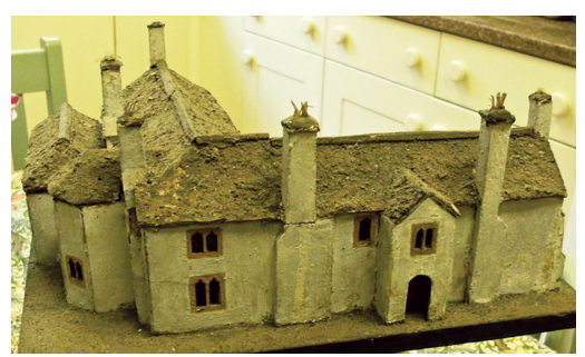
Fig. 9 Selworthy, Crossacres the early 19th-century model of the house seen from the north

Crossacres is constructed from local mixed Devonian rubble, visible on the west gable, otherwise obscured by painted render. The long walls of this rectangular building and the west gable are 100cm thick, possibly dating from as early as the 14th century. The model shows a storied porch that may have dated from the 15th century. In the late 18th century the building was repaired and the current roof is of that period having five