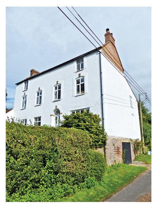
Fig. 6 Kingsbury Episcopi, Mid Lambrook, The White House, south-east elevation

the stairs and other rooms; beyond is another small extension. An extensive cellar is situated under the eastern part of the house with both internal and road level access. Further stairs extend to the attic.