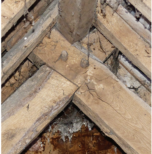
Fig. 13 Devon, Tytherleigh, Chard Rd, Penny Cottage & 2, Pinney Cottage, the halved and pegged truss apex

These two Tytherleigh Estate properties were sold off in 1928. The main range of one and a half storeys now comprises four units in-line. An original two-room house comprising a kitchen/living room and an unheated parlour had a single storey lean-to on the north wall providing a service area; all these walls were 55cm thick and together with the roof carpentry suggest a mid 18th-century date.