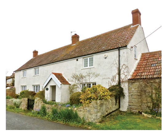
Fig. 8 Pawlett, 14 Gaunts Rd, Doidges House, south elevation

dating from the 16th century. Earl of Shaftesbury Estate maps of 1658 and 1780 were reviewed; on the earlier one a seemingly smaller property exists, perhaps two rooms with a central chimney.