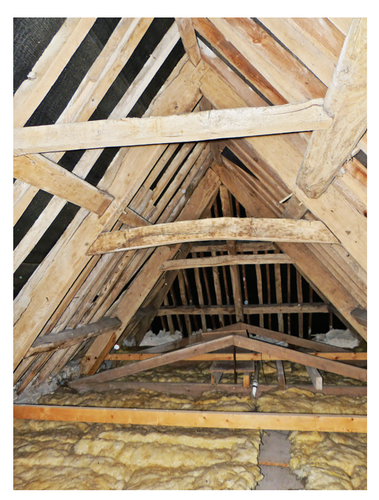
Fig. 3 Doulting, King's Rd, Hurlingpot Farmhouse, the roof trusses and the shallow hoist truss

A listed property. The house is almost square in plan, built of local rubble stone with dressed quoins. The symmetrical south front is faced with ashlar and a stone canopy porch sits on consoles over the front door. There are two rooms either side of a full height central stair-hall. Three further rooms range across the rear. Abutting the west elevation is a single storey lean-to, housing a well, and a conservatory. The windows are of local Doulting