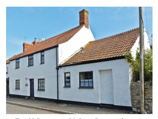
Fig. 10 Stogursey, 26, Lime St, west elevation

An octagonal addition on the east gable probably dates from the 1830s when Sir Thomas Acland, much influenced by John Harford's creation of Blaise Hamlet, rebuilt Selworthy Green.