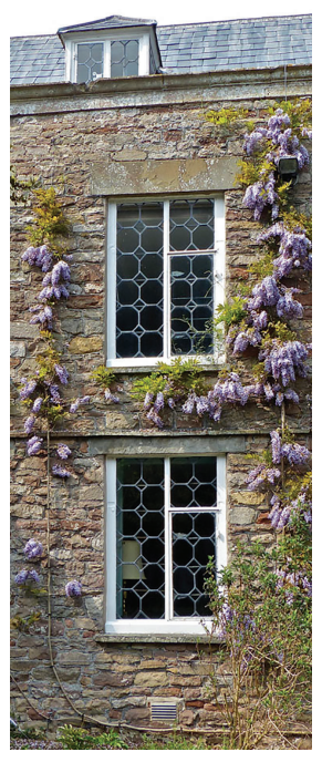
Fig. 11 Walton in Gordano, The Manor House, octagonal glazing and parapet cornice

A listed property. The main range of the house is two-storey with attics under a pitched roof; the ground floor comprises three rooms with a cellar below the eastern end. Abutting the rear of this range is a corridor, containing an open-well stair,