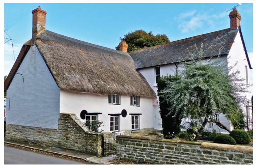
Fig. 7 Kingsbury Episcopi, Thorney, The Old Rising Sun, south-west elevation

A listed property. Once a public house and recorded as a Beerhouse in 1851, it is 'L' shaped and comprises two units. Initially it was a cob-built, one and a half storey two-room range under a thatched roof with gable end abutting the road and dating from the mid 17th century. The gable end is now built of brick in Flemish Bond on a masonry plinth. The cob walls