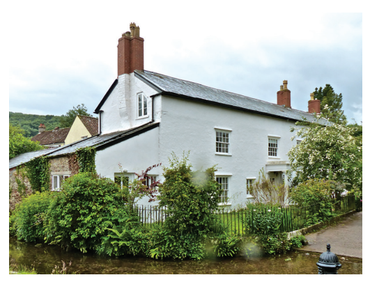
Fig. 1 Burrington. Rickford, Brook House from NE