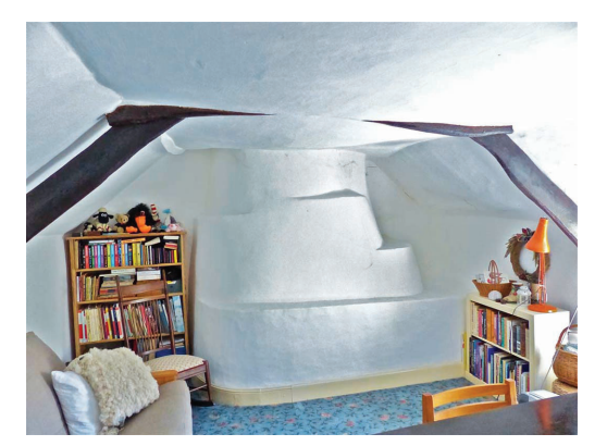
Fig. 12 Wambrook, Beechwood, rounded and stepped stack at first floor level

oven. To the north of the kitchen an extension, possibly a dairy or wash house was added.