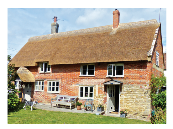
Fig. 5 Kingsbury Episcopi, East Lambrook, Townsend Cottage, south elevation

The roof carpentry, the use of cob, the wall thickness, and the rod & daub partitions suggest the house was built in the mid 18th century. In the early 19th century it was divided into two dwellings.