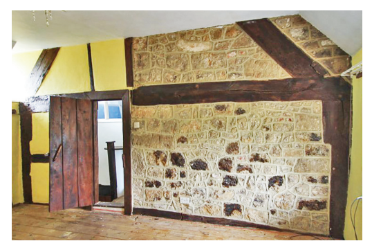
Fig. 2 Donyatt, Chard Rd, Thatchers Pond Frame FIII and truss with masonry replacing a possible fire hood of wattle and daub

In 1930 the property was divided into two dwellings incurring further internal restructuring; it has now been returned to a single dwelling.