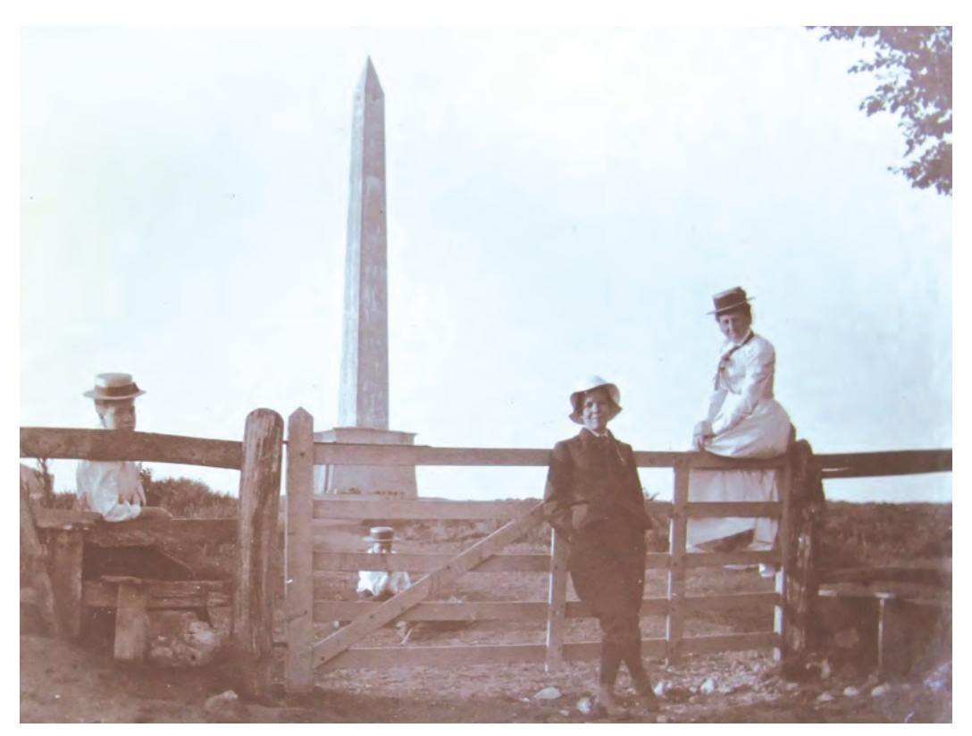
Fig. 6 Enjoying the Monument in 1900/01. The group are posed at the gate and former stile leading to Monument Farm and an accompanying photo suggests they had arrived by bicycle. Staining from washed out lime mortar can be seen on the shaft of the Monument.