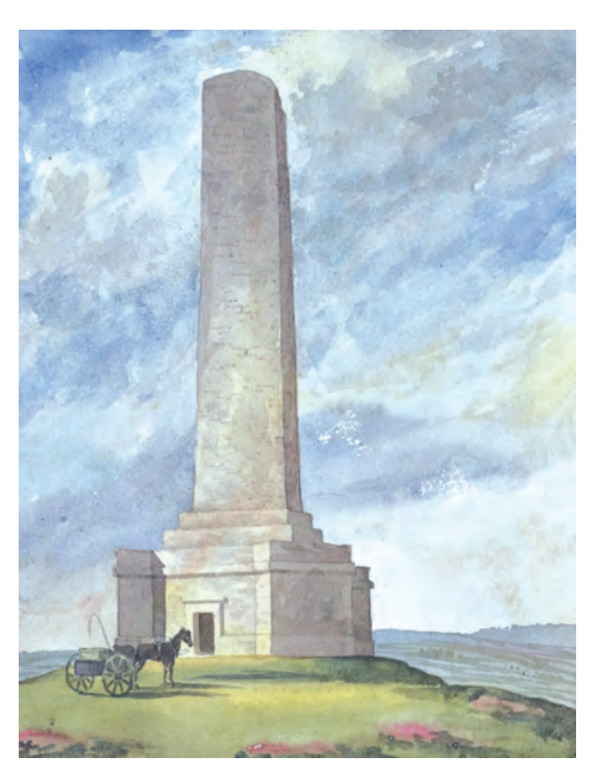
Fig. 3 The Monument as recorded in a watercolour drawing by Peter Orlando Hutchinson in the 1830s.

There was revived interest in completing and repairing the Monument following the death of the Duke of Wellington in 1852. The Illustrated London News included an article on the town in December 1852, which includes an engraved drawing of the