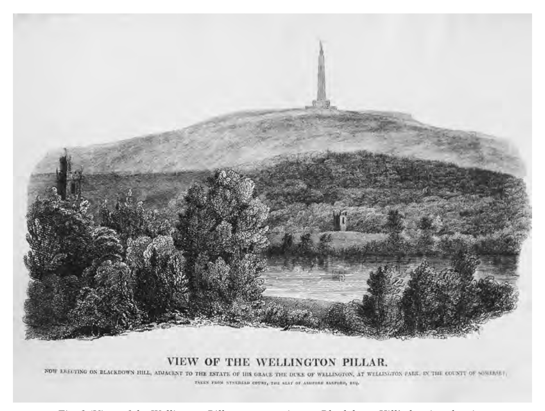
Fig. 1 'View of the Wellington Pillar now erecting on Blackdown Hill' showing the view from Nynehead Court.