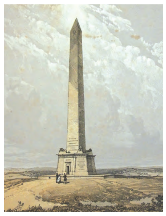
Fig. 4 'Proposed design for the restoration of the Wellington pillar, Wellington. Messrs Goodridge Architects, Bath'. Lithograph. A copy is held by SHC