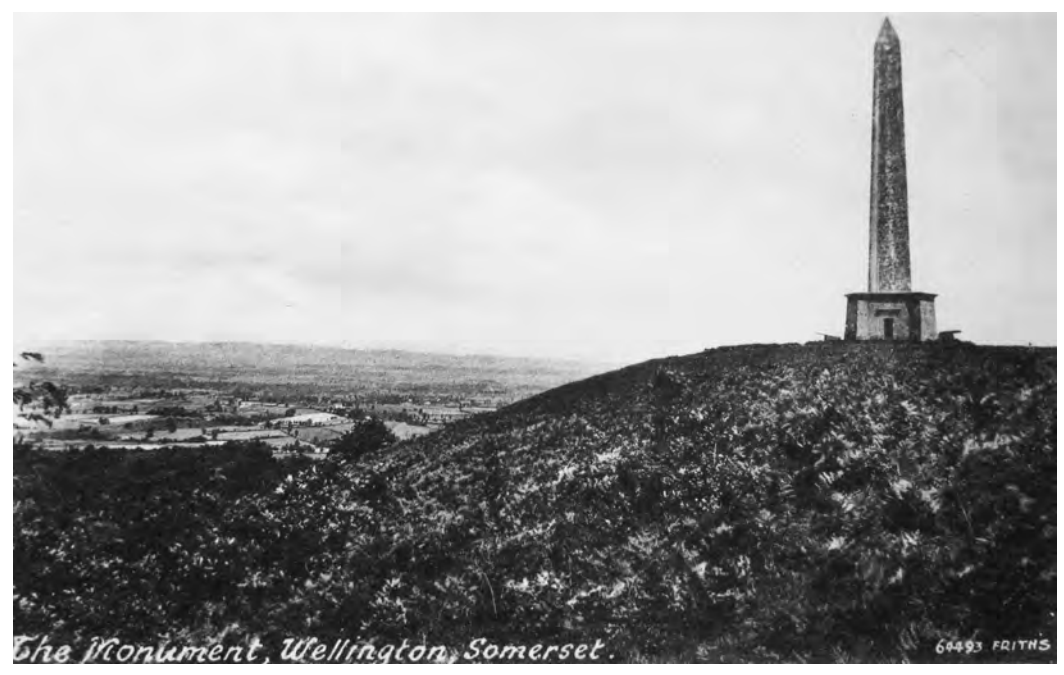
Fig. 2 A postcard from the collection held by Wellington Museum. The cannon at the base of the Monument date the image between 1911 and 1941. Note the open aspect and remnant of heathland vegetation on the surrounding hilltop area.

around the Monument is shown on the Tithe Map as remaining uncultivated and has remained so since. It still retains remnants of its original heathland vegetation today. Early photographic postcards, mostly dating from the first half of the 1900s, show this open character, see for example Fig. 2.<sup>21</sup>