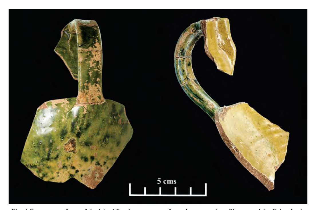
Fig. 4 Fragments of one of the lobed Border ware cups from the excavation.

Two small flint debitage flakes were found in amongst the tumble; one white and heavily patinated, the other translucent black. Neither showed secondary working nor any features that were dateable.