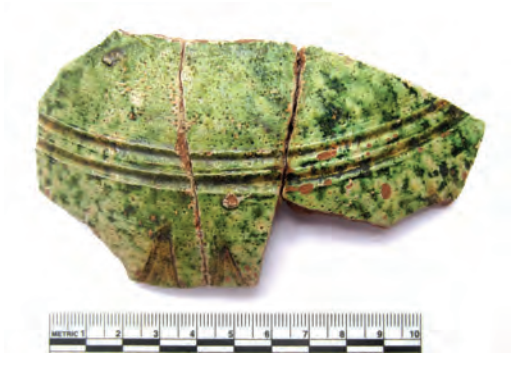
Fig. 3 Three sherds of a copper-splashed slipcoated sgraffito ware possibly from East Somerset of similar date to the Border ware

earth binding the structure together. Inside the building the floor was an irregular surface of the underlying yellowish mudstone, with no evidence of any prepared floor. The same geology formed the natural bedrock outside of the building. One side only of a doorway was identified on the eastern wall; the other jamb had collapsed, or had been robbed, and its location was not clear. There were slight indications in the bedrock that the doorway may