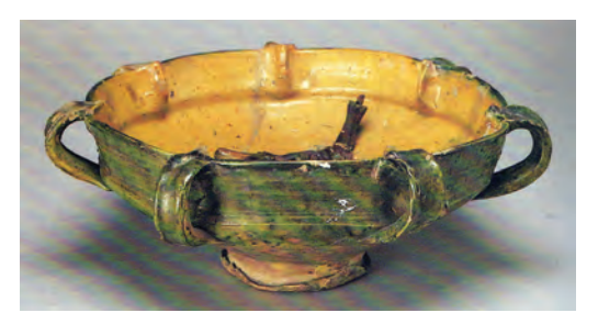
Fig. 5 An example of a lobed cup of Border Ware from Pearce Fig. 34

In addition, two sherds of a mottled green glazed 13-14th century Bristol Redcliffe ware jug were found in the topsoil about 10m south of the excavation (not illustrated).