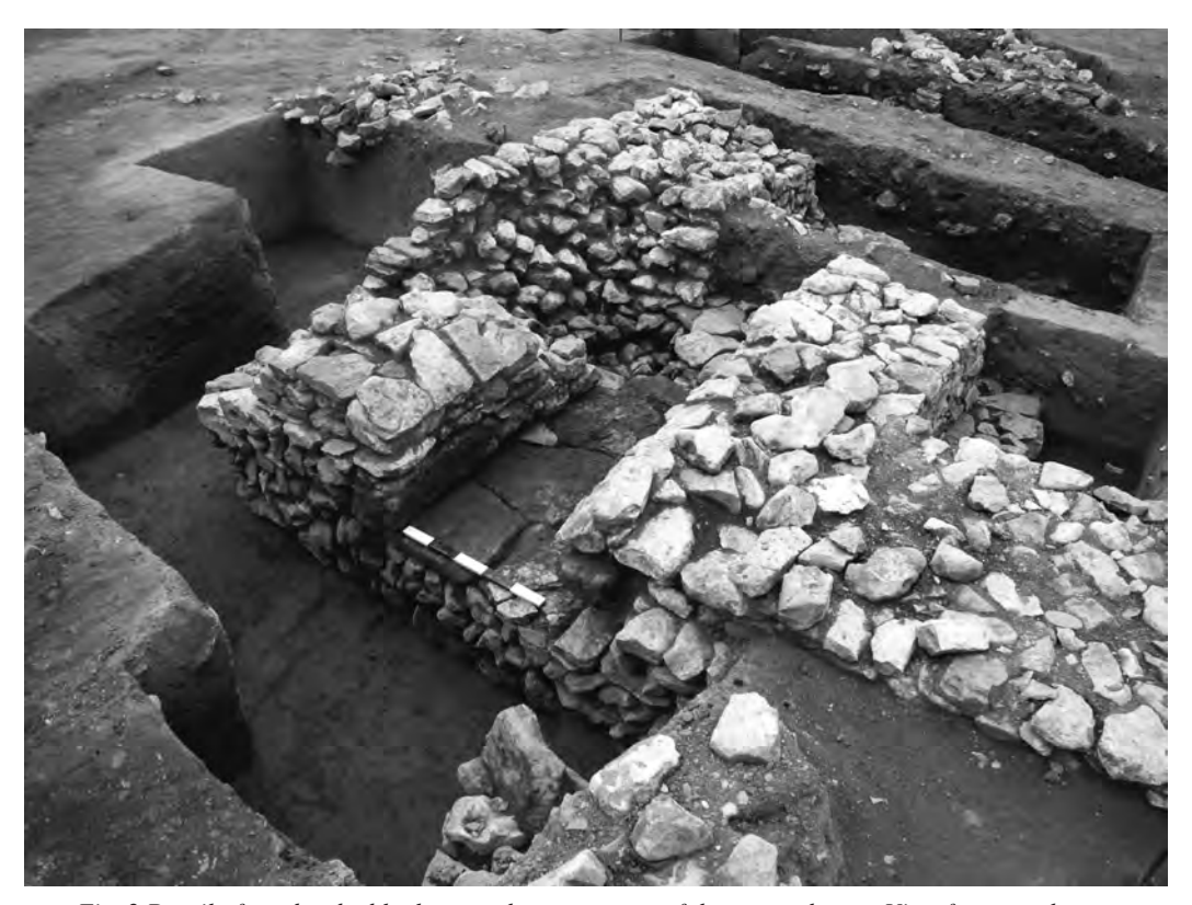
Fig. 2 Detail of garderobe block at south-west corner of the manor house. View from south-east

clean, with domestic debris disposed of on middens, of which no trace has survived, or directly on to fields, and the few pits produced very little.