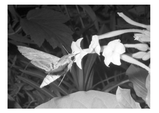
Fig. 1 Convolvulus Hawk-moth (Agrius convolvuli)

armigera ) on 25 June which, until the beginning of September, was the only 2012 British record. October saw more migrant activity on the south coast and this led to a Delicate ( Mythimna vitellina ) at Norton-sub-Hamdon on the 22^{nd} and another at Thurlbear on the 25^{th} .