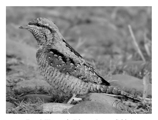
Fig. 1 Wryneck

A Woodlark flew over Lilstock in mid-October, a typical autumn record but the only one in 2010. Yellow-browed Warblers are now recorded virtually every year, and there was a good showing with six in autumn, mostly on the coast. An Aquatic Warbler was trapped at Steart on 4 September, raising the county total to 84.