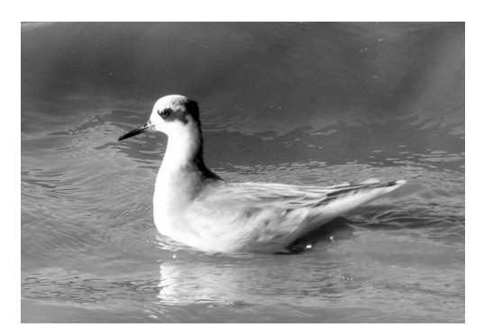
Fig. 2 Grey Phalarope

For the second year running, Avocet numbers in the Parrett estuary exceeded 200 in November. Scarce waders included two Little Stints, and three Pectoral Sandpipers, two at sites in the Avalon Marshes and one at Huntspill.