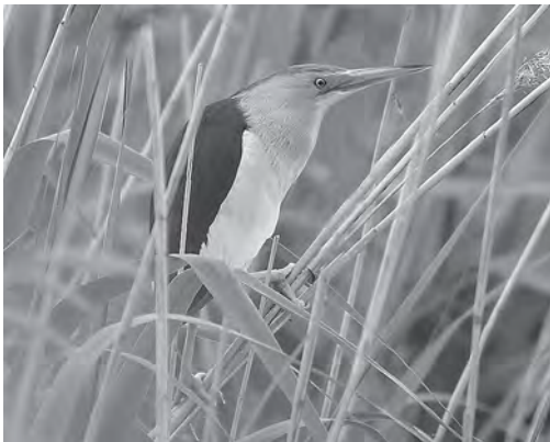
Fig. 1 Little Bittern

Somerset is fast gaining a reputation as the heron county par excellence , and Little Bittern seems unlikely to remain the only rare heron to breed for