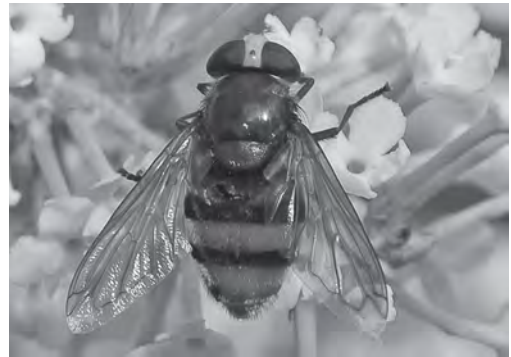
Fig. 1 Volucella zonaria