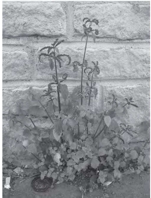
Fig. 1 Urtica membranacea in Nailsea

Amongst the aliens, two noteworthy additions to our flora in 2010 were Urtica membranacea (Membranous Nettle) (Fig. 1), found at the edge of a pavement in Nailsea, and Galium murale (Small Goosegrass), discovered on the pavement of the Royal Crescent in Bath. These species are both Mediterranean winter annuals. U. membranacea was first recorded in Britain in Warwick in 2006 (Boucher and Partridge 2006); G. murale formerly occurred as an infrequent wool alien, but has suddenly cropped up again in the last few years, first in Cornwall and then in Eastbourne, Sussex (Nicolle 2008). Both species are likely to have arrived recently as stowaway weeds of Mediterranean container plants (eg palms, olives or figs), following an increasing preference for such dramatic plants. Changes in the fern flora of Bath have been described previously by Crouch and Rumsey (2010); but no sooner had that paper been finished than another new alien fern, Pteris tremula (Tender Brake) (Fig. 2), was found growing from stonework in the Royal Crescent, in this case illustrating not so much a change in horticultural fashion but rather a reduction in