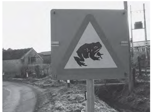
Fig. 1 Toad crossing sign at Rumwell, near Taunton

The national amphibian conservation charity ‘Froglife’ keeps a register of toad patrols showing that there are currently eight crossings in the county registered as ‘active’, plus a further two in the North Somerset administrative district. ‘Active’ means that there are patrollers manning the crossing and submitting records of toad numbers to the organisation. There are also a number of patrols that have been active in the past but are now no longer so – presumably because people’s circumstances have changed rather than those of the toads!