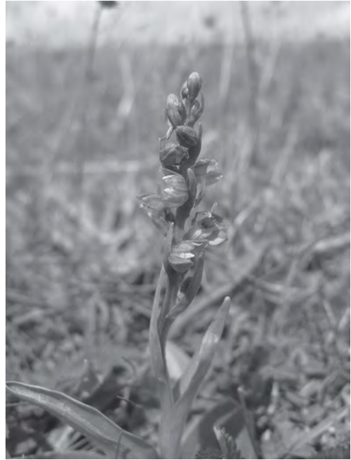
Fig. 3 Coeloglossum viride on White Sheet Down