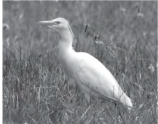
Fig. 3 Cattle Egret

centres. There are breeding colonies on at least four sites in Somerset, with year on year increases in population.