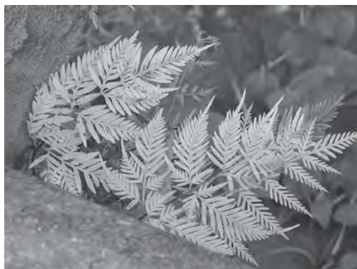
Fig. 2 Pteris tremula in the Royal Crescent, Bath