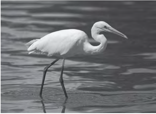
Fig. 2 Great White Egret