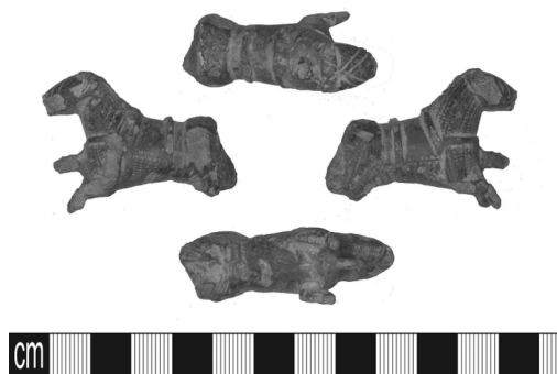
Fig. 8. Barrel lock or padlock from Strington

A cast copper-alloy barrel lock or padlock is in the shape of a horse (Fig. 8). The lock is 41.45mm in length, 34.20mm wide, 15.20mm thick and weighs 30.9g. The horse's head is featureless, but decorated with crossed double grooves mimicking a bridle. There are two raised lines across its back and one across its neck, forming the harness and saddle. The sides and neck are decorated with thin parallel lines filled with smaller lines, perhaps to suggest armour, and one side of the neck has grooves forming a mane. The two forelegs remain, but the hind legs are missing. There are circular openings at the horse's muzzle and rump, both filled with iron erosion and a small strip of copper alloy protrudes from the horse's chest. The object appears to have been hollow and this erosion and the copper-alloy strip are presumably the remains of the locking mechanism. A similar lock, dating from the 12th to mid 13th century, was found during excavations at Winchester (Biddle 1990, 1011, fig. 313, no. 3665) suggesting a similar date for this example. This find has now been acquired by the Museum of Somerset.