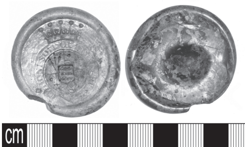
Fig. 11. Bottle seal from Merriott