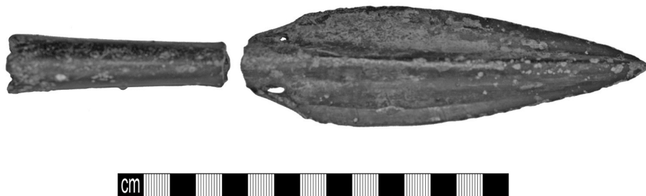
Fig. 4. Spearhead from Stocklinch

This fragment of a copper alloy circular bracelet or arm ring is probably of mid to late Iron Age date