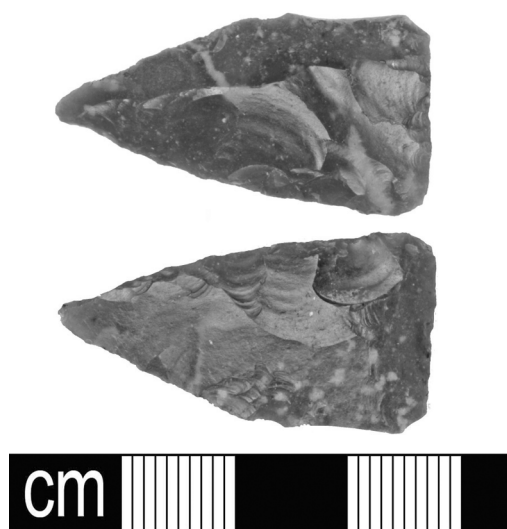
Fig. 2 Neolithic arrowhead from St Cuthbert Out

22.68mm wide and weighs 79.34g. The blade is 'flame' shaped with low blade ribs. The loops are incorporated into the curved base and the loop plates are squeezed inwards slightly. The midrib section is lozenge shaped in section, whilst the stem is circular, splaying slightly towards the end.