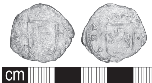
Fig. 10. Spanish cuartillo from Otterhampton

On the obverse can be seen a crowned coat of arms, with the letter B to right surrounded by the inscription PHILIPPVS DEI GRATIA. On the reverse is a further crowned coat of arms surrounded by the inscription REX HISPANIARVM. Barry Cook (pers. comm.) notes that this coin was only in fact issued from a group of mints in 1566, so it can be dated precisely.