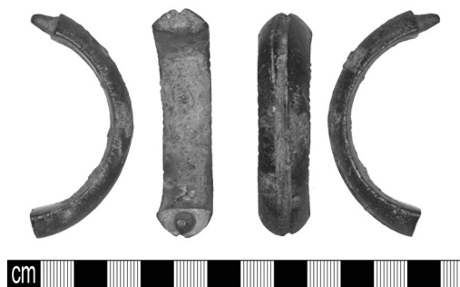
Fig. 5. Bracelet or arm ring from Westbury-sub-Mendip

(Fig. 5). The internal edge is c. 68mm in length, whilst the external edge is c. 88mm in length, the object is 7.02mm thick and weighs 46.36g. The fragment comprises around one third of a sectional circular bracelet. At one end is a deep circular recess and at the other end a similarly shaped projection, which presumably would have allowed the section to be attached to the rest of the bracelet; the projection fitting into the recess and vice versa at the other end. The exterior face of the bracelet is decorated with a crude and uneven central groove, flanked on either side by short parallel scratches. The bracelet bears similarities to several illustrated by Jope (2000, pl. 32, 33). Although these are frequently very different in decoration, most have a similar mortice and tenon attachment. A very similar example can also be seen on the PAS database from Dorset, under reference DOR-6C0200.