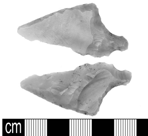
Fig. 3 Neolithic arrowhead from St Cuthbert Out

The point of maximum width is c. 27% up the blade, making this a Davis type 2, which was the largest group in his corpus (Davis 2006, 33). There is a lot of variation within this group, but this particular example appears to fit best into Davis' variant C, which is characterised by 'loop plates squeezed inwards, causing an indentation in the arc of the blade edge from socket to tip' ( ibid. , 34). The development of these he traces back to the group 2 British side-looped series, whose blade shapes are