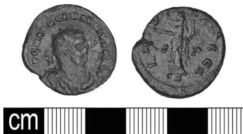
Fig. 6. Radiate from Butleigh

inscription, PROVID AVGGG, has never been recorded previously as usually there would only be two Gs at the end. The coin has now been acquired by the Museum of Somerset.