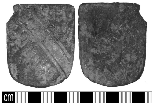
Fig. 7. Mount from Martock

The enamelled arms appear to most likely be those of the de Bohun family, which according to Burke