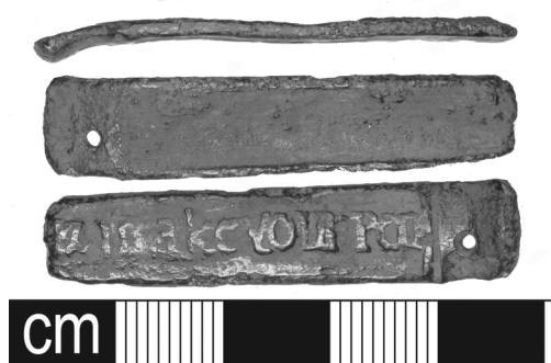
Fig. 9. Mount from Holford

The original function of the object is difficult to determine. However, the style of lettering suggests a post-medieval date, possibly of 16th to mid 18th-century date. It must be noted that the object does have a resemblance to the handles of several skillets of around this date and the lettering is very similar. However, its shape, size and delicate construction suggests that it unlikely to be related to such vessels.