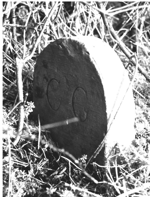
Fig. 3 One of the numerous stones which formerly marked the Church Estate lands. Similar stones inscribed EWLP defined the Popham estate properties

A major extension of the aims of the feoffees occurred in 1857 when the energetic vicar, Wilson