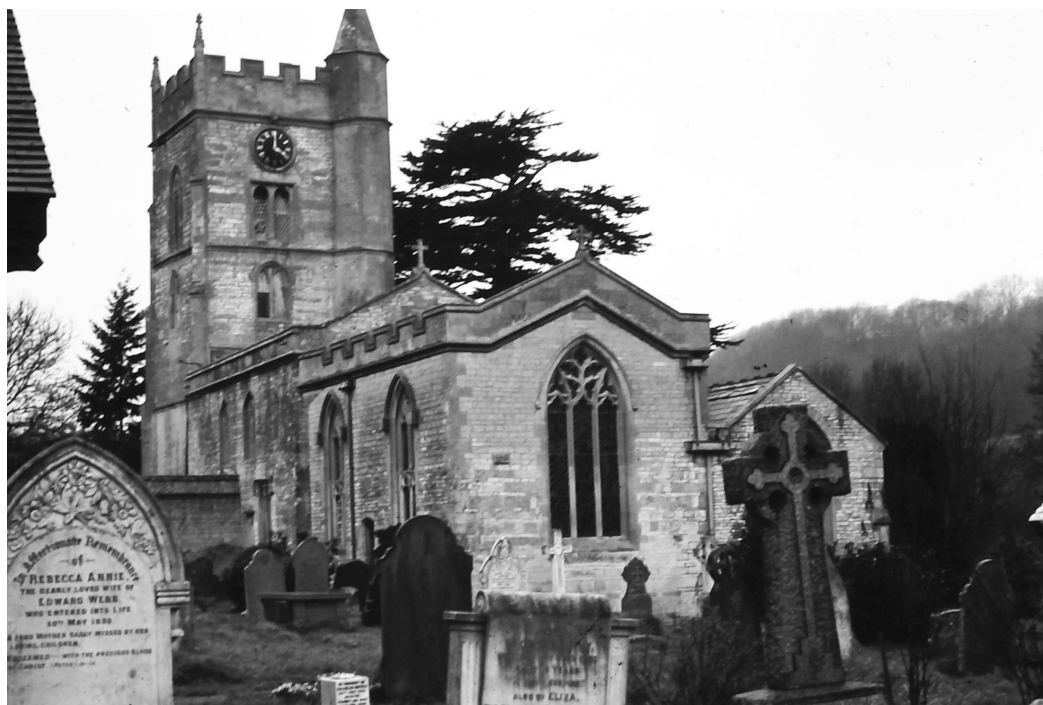
Fig. 1 Church of St Mary the Virgin, Compton Dando

Throughout the Middle Ages the land at Compton Dando was divided between the Benedictine abbey of Bath and the Augustinian abbey of Keynsham. A long list of those to be prayed for by the monks of Bath in 1316 includes 'Fulco de Anno [Dando] who gave us Compton and the lands at Sortis and land at Kokeredshulle, and the mill of Compton'. 2 The canons of Keynsham possessed the manor house [capital messuage] and land in the common fields of Compton Dando. 3 In the decades before the final dissolution of all the monastic houses during 1536–39, it was obvious to abbots and priors that major change was inevitable. There was increasing interference in monastic affairs by the Crown