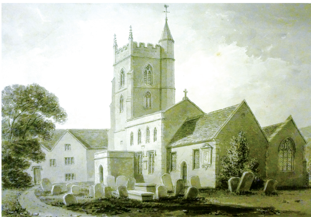
Fig. 2 Compton Dando Church and Vicarage in 1847 by J. Buckler.

The sum of £98 6s 10d had been spent on painting the church and purchasing new covers, cushions and carpets for the pulpit, reading desk and altar. The major expenditure in 1820 was necessary to rebuild the north wall of the nave, although there