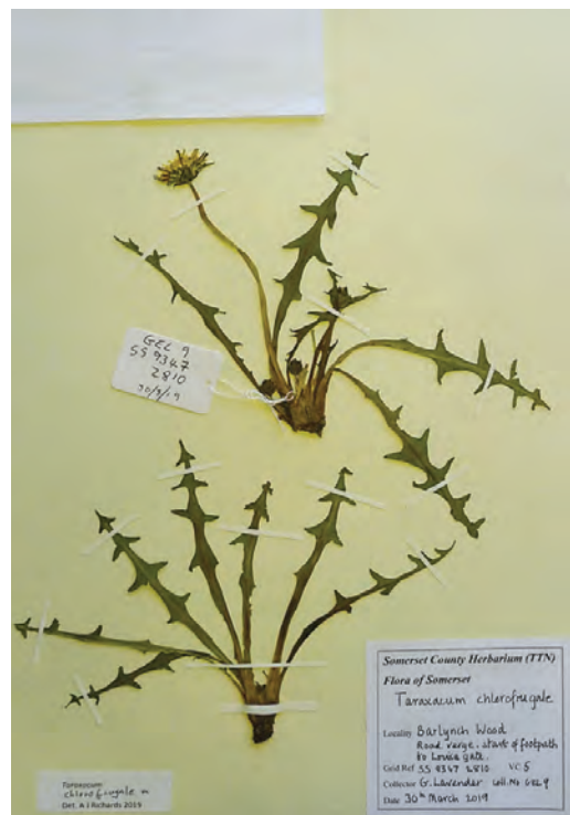
Fig. 2. Taraxacum chlorofrugale, collected from Barlynch Wood, Exmoor; voucher specimen to be held at SANHS/ Somerset County Herbarium (TTN)

Taraxacum amicorum - [1] Taunton, Sherford Road, in lane-side flower border (ST 2248 2326), 1 May 2017, SJL, det. AJR (this is the specimen originally determined as T. litorale and illustrated in SANH 161, p. 312, Fig. 2). [2] Taunton, Tangier Way/Wood Street, grassy road verge (ST 2256 2483), 14 Apr 2018, SJL, det. AJR, voucher deposited at National Museum of Wales in Cardiff (NMW), and designated the 'TYPE SPECIMEN'. [3] Taunton, brick path in back garden of 15 Trinity St (ST 2350 2440), 9 Mar 2017 and 6 May 2018, SJL, det. AJR (originally determined as T. britannicum). [4] Thurlbear Wood, edge of path through woodland (ST 2673 2060), 8 May 2018, SJL, det./conf. AJR. [5] Adcombe Wood, footpath/track through woodland (ST 229 184), 18 May 2018, SJL, det./conf. AJR. [6] Orchard Wood, wood-bank beside public footpath (ST 252 201), with T. atrocollinum and T. laticordatum, 15 Apr and 28 May, SJL, conf. AJR. [7] G.B. Gruffy SWT nature reserve, in rushy grassland (ST 476 564), 13 May 2017, R.D. Randall, det. AJR (although originally 'indet.'); this is so far the only record for VC6.