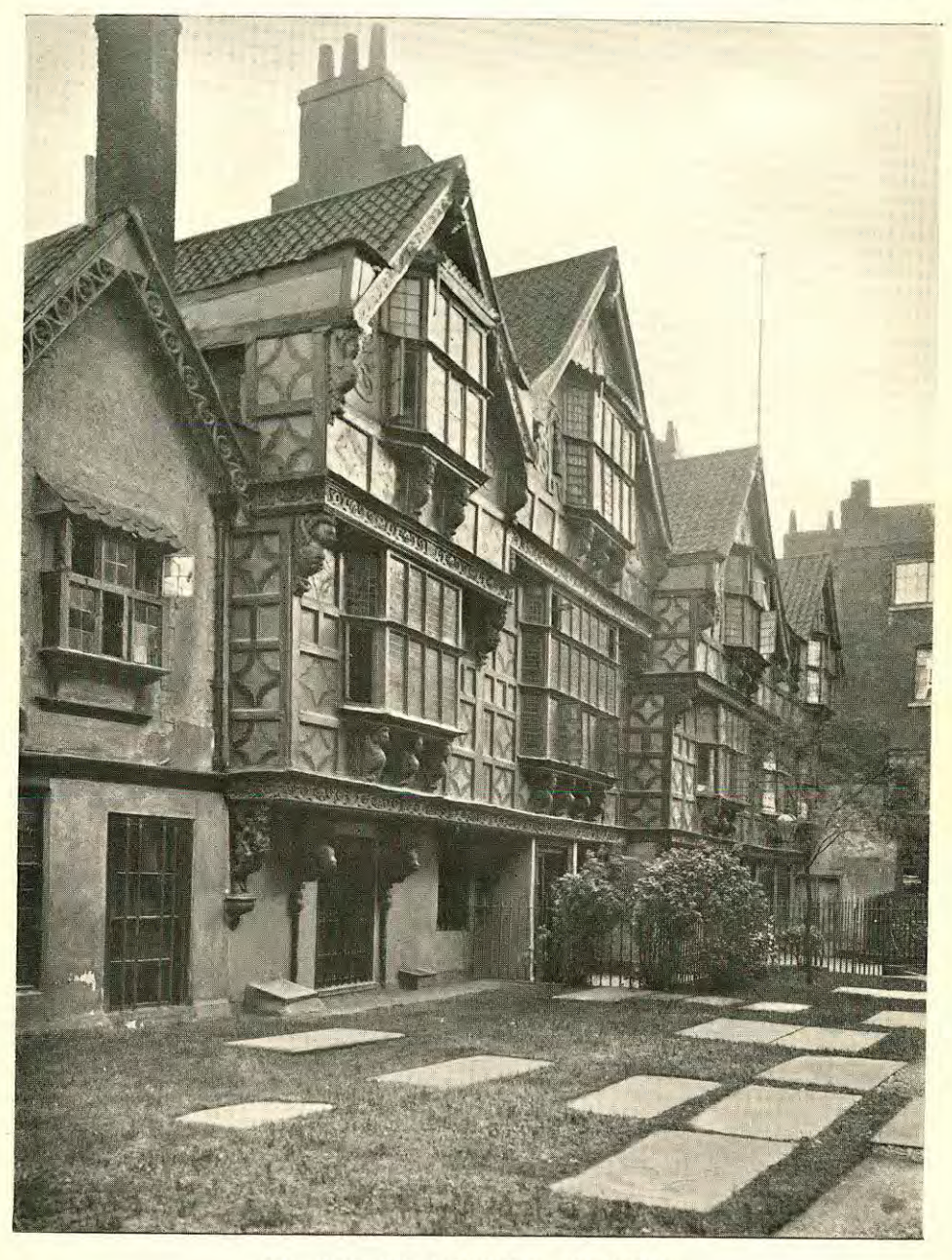
ST. PETER'S HOSPITAL, BRISTOL.