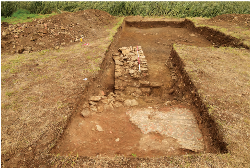
Fig. 3. Excavation of trench B at Lufton Roman villa showing part of bathhouse and fish mosaic.

for building materials, including what is probably Exmoor slate, were recovered.