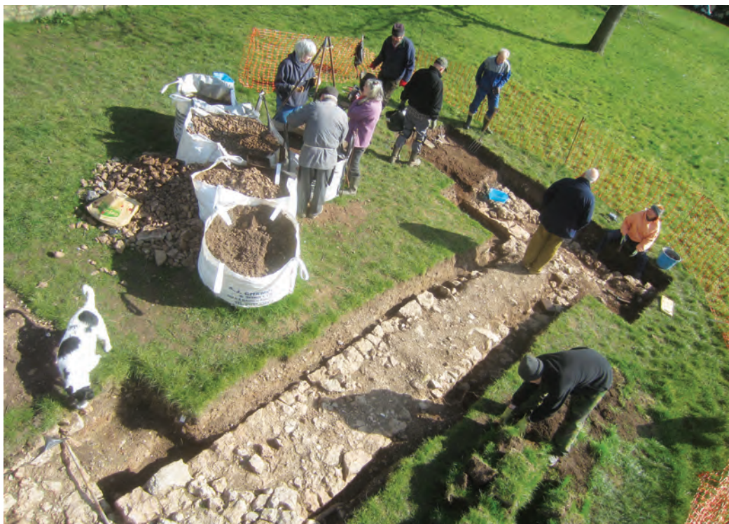
Fig. 4 Excavations at Court House Farm by the Westbury Society

side by an orchard and by newer buildings on the other. The three outer walls average 1m thick where they haven't been robbed out. Running parallel to the southern wall are another two interior walls. The northernmost of the two is probably a later addition. The southern interior wall appears to have been rebuilt at some stage, as there is a noticeable ledge and some misalignments between the upper and lower courses. Most of the stone used in the construction is a local dolomitic conglomerate, with occasional finer dressed pieces of Doulting origin, particularly in the clasping buttress in the south-west corner, but also at one of the proposed. The finer masonry appears to be on the western wall, and this may be considered as the front wall. A piece of Bristol Redcliffe ware and a piece of Ham Green B ware (c.1175–1275) were discovered above a possible floor surface. Copious amounts of as yet undated, possibly late Saxon, coarseware argue for an earlier phase of occupation. Beside the medieval ceramics, a not insignificant quantity of residual Roman pottery has also been found. The Domesday Book records the Bishop of Wells