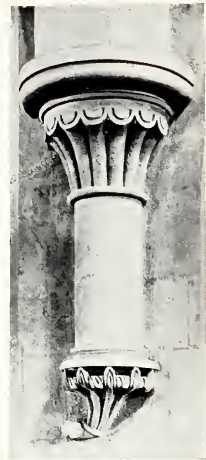
FIG. 3. TRANSITION-NORMAN RESPOND.