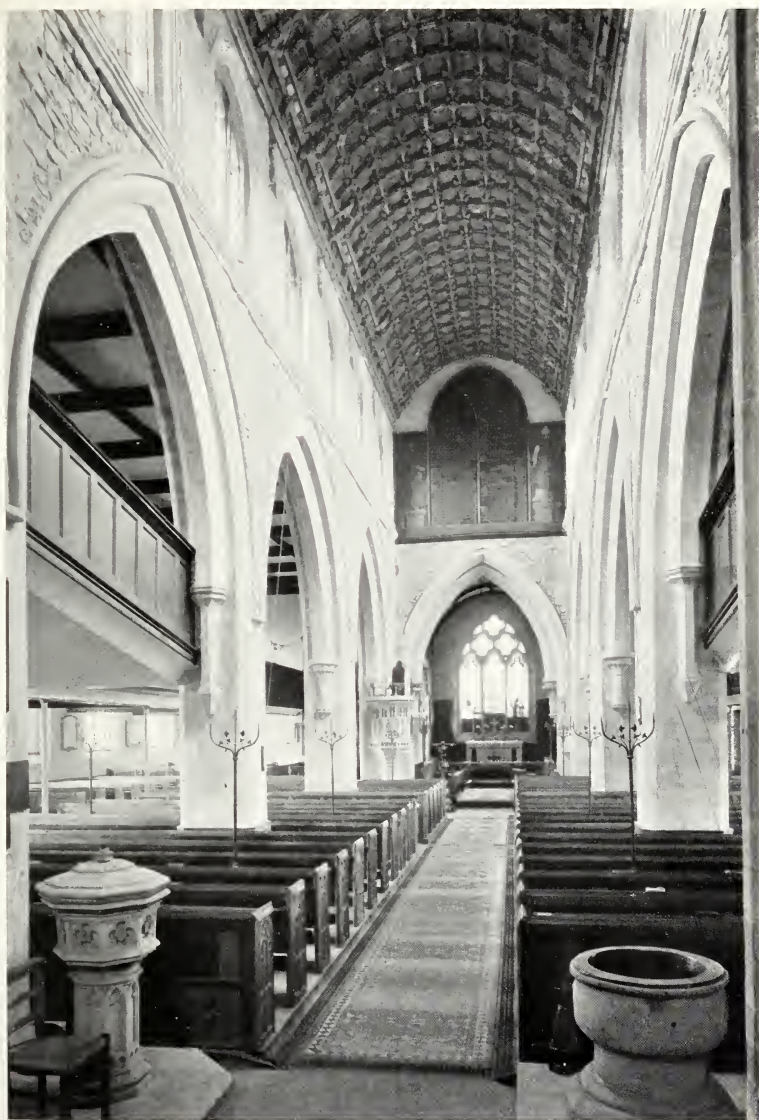
SHEPTON MALLET CHURCH.