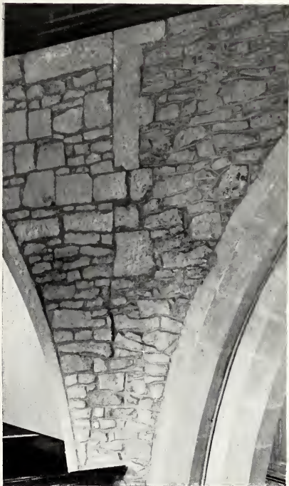
FIG. 1.—EARLY QUOINS IN S. AILE.