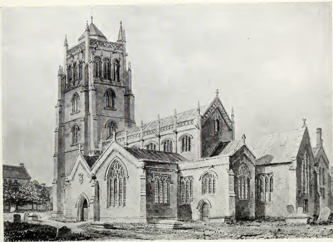
SHEPTON MALLET CHURCH FROM THE S.E., 1833.