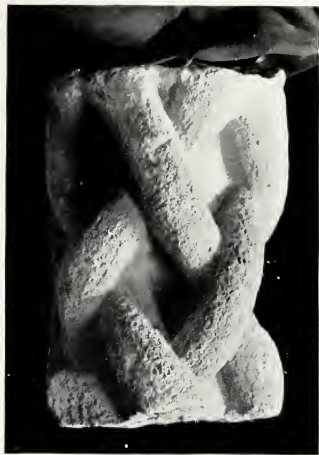
FIG. 1.—FRAGMENT OF EARLY COLUMN.