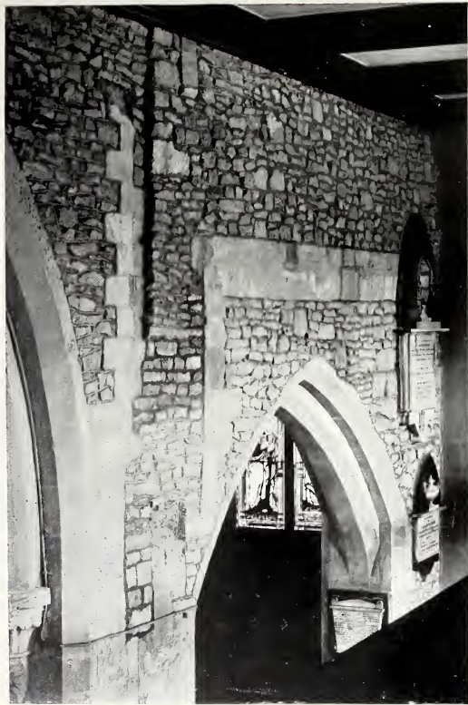
FIG. 1.—MASONRY AT E. END OF S. AISLE.