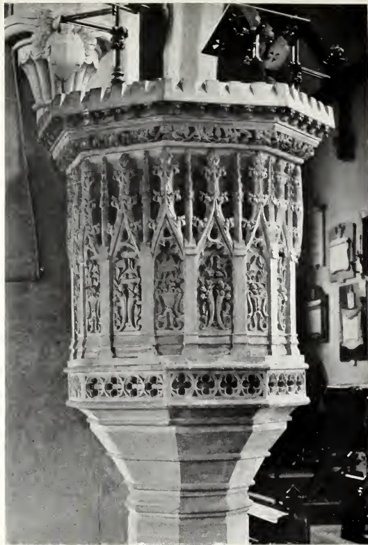
FIG. 2.—STONE PULPIT.