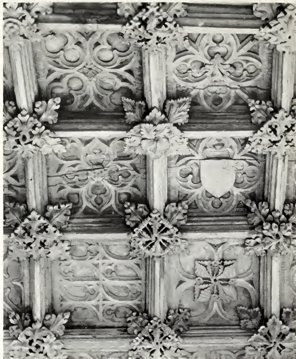
OAK CEILING, SHEPTON MALLET CHURCH. Specimens of the 350 different Designs.