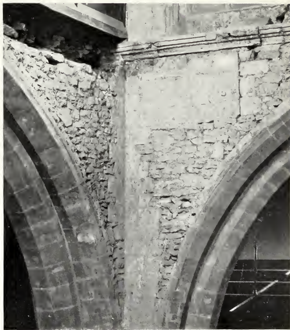
FIG. 2.—MARKS OF (?) ROOD-LOFT, S.E. CORNER OF NAVE.