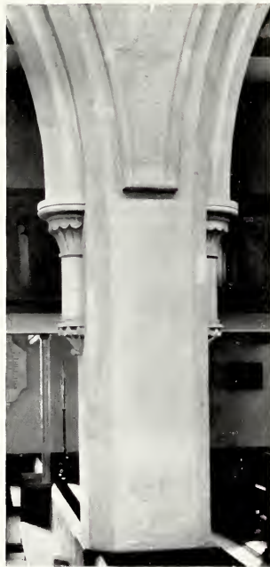
FIG. 2.—TRANSITION-NORMAN PIER. SHEPTON MALLET CHURCH.