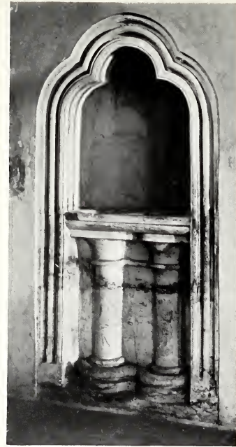
FIG. 2.—DOUBLE PISCINA.