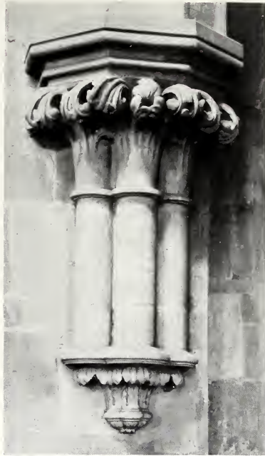
FIG. 1.—RESPOND OF CHANCEL ARCH.