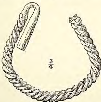
Portion of a Gold Torc, found on Allington Down, N. Wilts, 1844.

WILTSHIRE.—On Tan Hill, Allington Down, north side of the Vale of Pewsey, a large portion of a funicular torc, having one terminal remaining, was found on Oct. 11, 1844, by a labourer digging for flints, at a depth of 18ins.; weight 2ozs. 10dwts. 11grs.; length