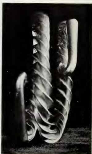
GOLD TORC, HENDFORD HILL, YEOVIL, 1909.