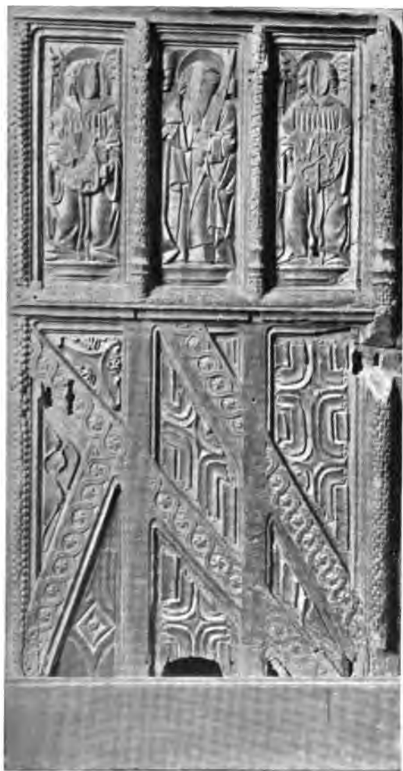
OLD DOOR SUPPOSED TO BE FROM TAUNTON PRIORY.