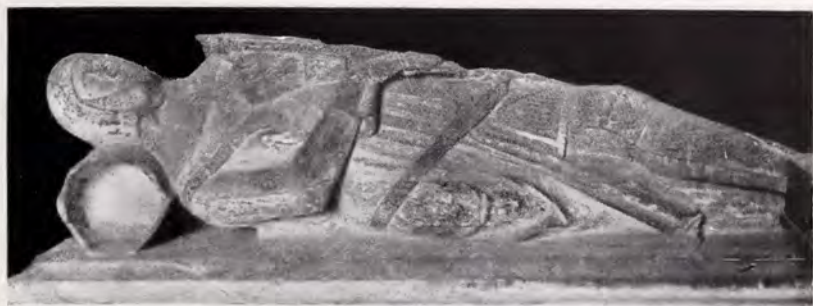
Fig. 1. LIMINGTON (No.2). Ham Hill stone; "Sir Richard Gyverney". C. 1330.