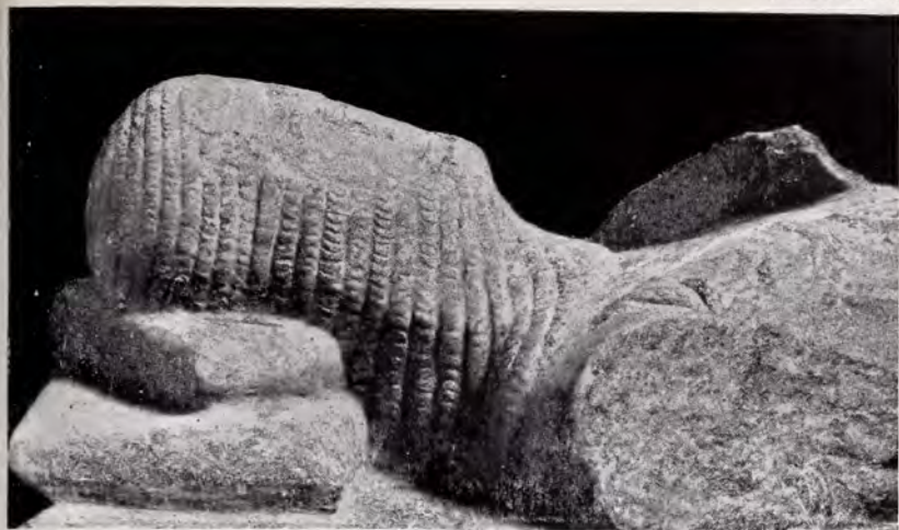
Fig. 1. TICKENHAM (No.2). Dundry-stone "Knight". C. 1260.