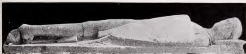
Fig. 1. SHEPTON MALLET (No.1). Douling-stone "Knight". C. 1240.