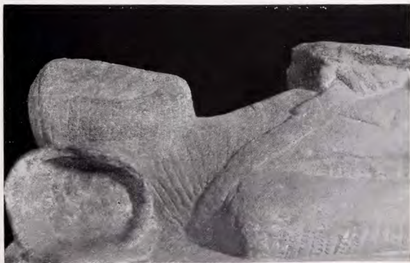
Fig. 2. CHILTHORNE DOMER. Ham Hill stone "Knight". 1270-1280.

EFFIGIES OF CHAIN-MAIL "KNIGHTS", SOMERSET.