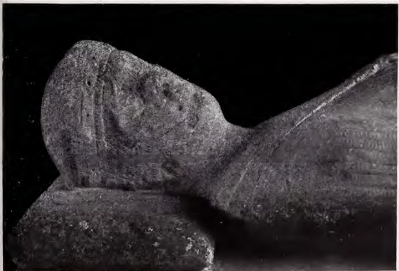
Fig. 3. TICKENHAM. (Enlargement of Head of Fig. 2). EFFIGIES OF CHAIN-MAIL "KNIGHTS", SOMERSET.