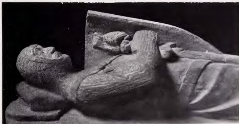
Fig. 3. BRYMPTON D'EVERCY. (Enlargement of Fig. 2).

EFFIGIES OF CHAIN-MAIL "KNIGHTS", SOMERSET.