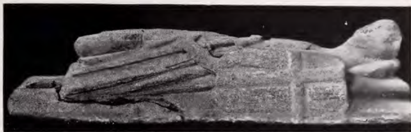
Fig. 1. CURRY RIVEL. Ham Hill stone "Knight". 1270-1280.