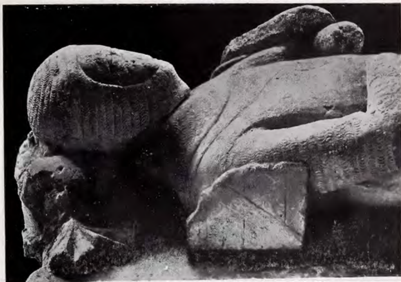
Fig. 2 COMBE FLORY. (Enlargement of Fig. 1).