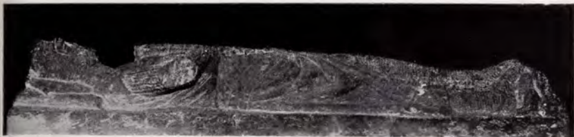
Fig. 1. ST. MARY REDCLIFFE (Bristol). Dundry-stone "Knight". C. 1260.