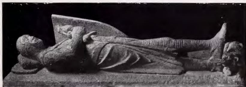
Fig. 2. BRYMPTON D'EVERCY. Ham Hill stone "Knight". C. 1270.