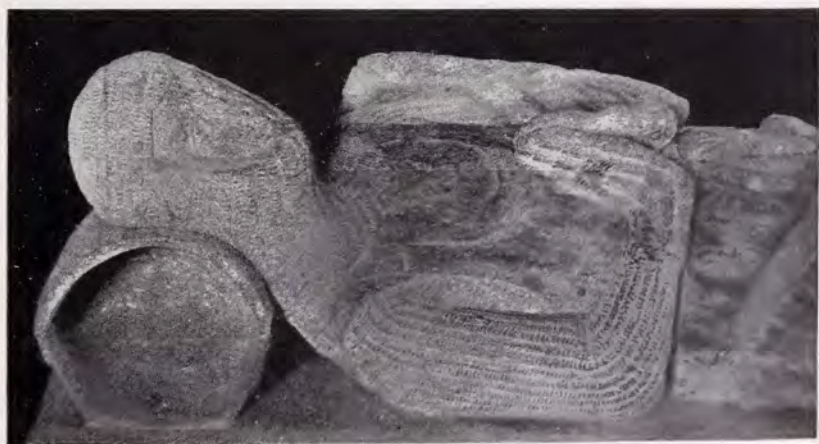
Fig. 2. PENDOMER. (Enlargement of the Effigy in Fig.1).

EFFIGIES OF CHAIN-MAIL "KNIGHTS", SOMERSET.