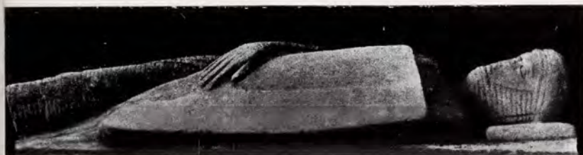
Fig. 2. SHEPTON MALLET (No. 2). Douling-stone "Knight". C. 1240.