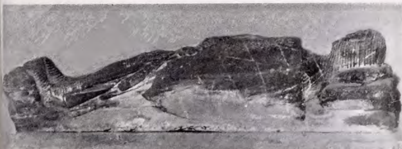
Fig. 3. NETTLECOMBE. Ham Hill stone "Knight". C. 1260.

EFFIGIES OF CHAIN-MAIL "KNIGHTS", SOMERSET.