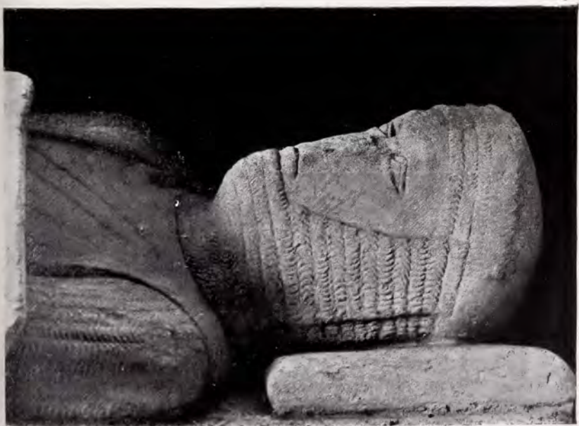
Fig. 3. SHEPTON MALLET. (Enlargement of Head of Fig. 2).

EFFIGIES OF CHAIN-MAIL "KNIGHTS", SOMERSET.