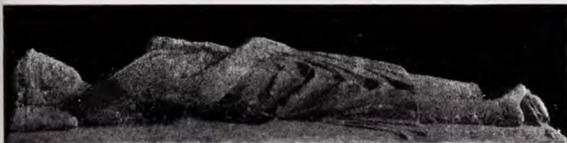
Fig. 2. TICKENHAM (No.1). Dundry-stone "Knight". C. 1240.