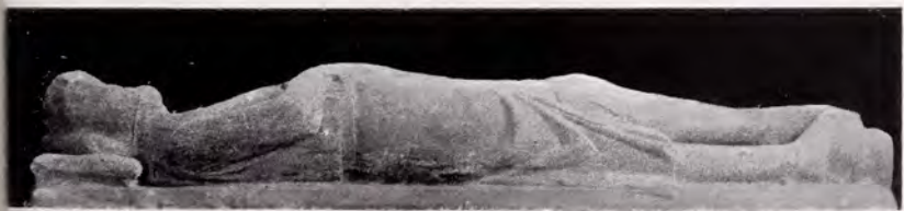
Fig. 3. KINGSDON. Ham Hill stone "Knight". 1270-1280. EFFIGIES OF CHAIN-MAIL "KNIGHTS", SOMERSET.