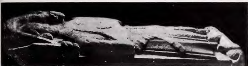
Fig. 1. PAULTON. Lias-limestone "Knight". 1290-1300.