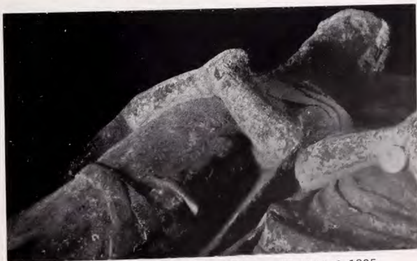
Fig. 3. LIMINGTON (No.1). Ham Hill stone "Knight", C. 1325. EFFIGIES OF CHAIN-MAIL "KNIGHTS", SOMERSET.