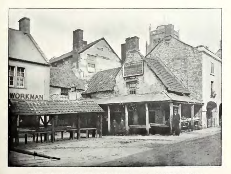
MODERN SHAMBLES AND PART OF ANCIENT ONES, SHEPTON MALLET. (ABOUT 1885.)