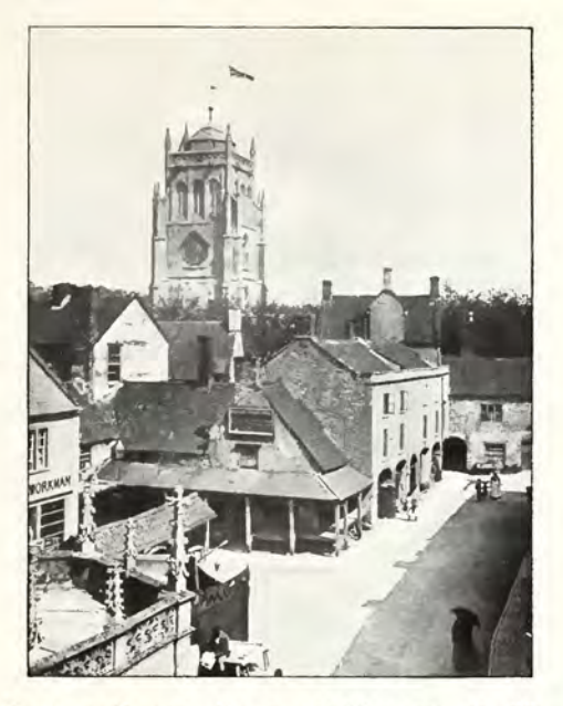
MARKET PLACE, SHEPTON MALLET, IN 1882.