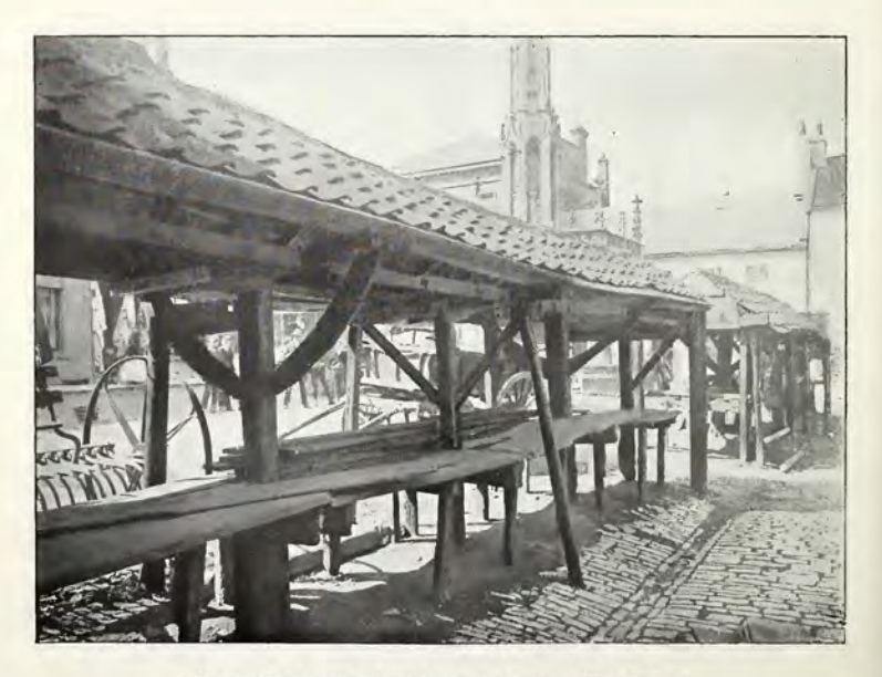
THE SHAMBLES AT SHEPTON MALLET: INTERNAL STRUCTURE.