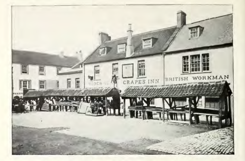
MEDIEVAL SHAMBLES AT SHEPTON MALLET: GENERAL VIEW.