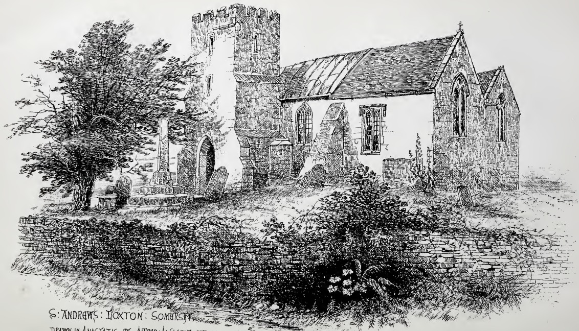
S: ANDREW'S: ILOXTON: SOMERSET